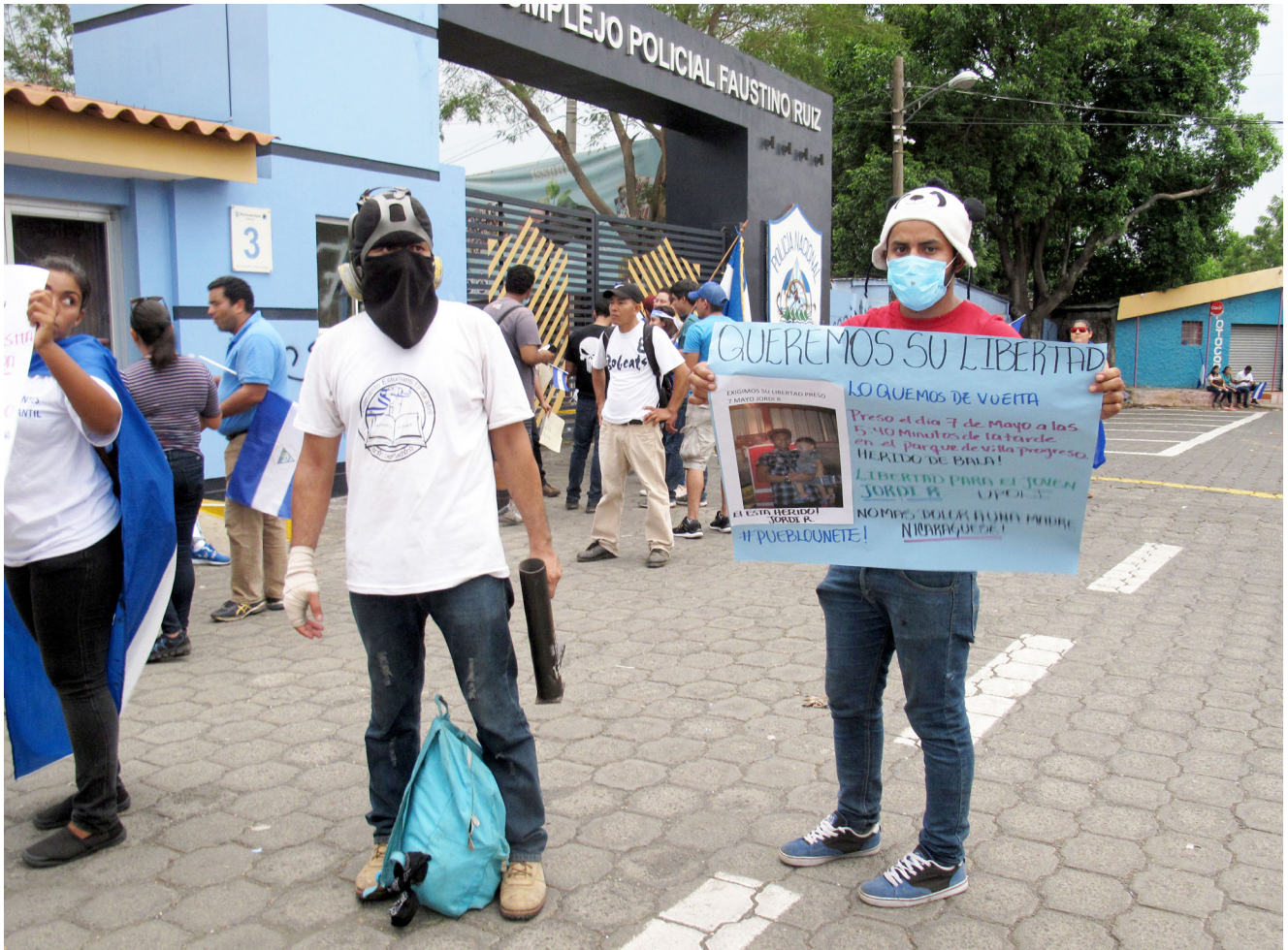
Figure 11 9 May 2018, Managua, Nicaragua. Towards the end of a march in Managua, protesters gathered in front of the headquarters of the national police, demanding the release of political prisoners. To the left, a man wears a T-shirt with the insignia of the 'Movimiento estudiantil 19 de abril' (the 19 April Student Movement), an organization that was formed in response to the violence of the Ortega regime. The other man holds a handmade poster with information about a fellow student from the Polytechnics University (UPoli) who has been injured, and is arbitrarily detained.