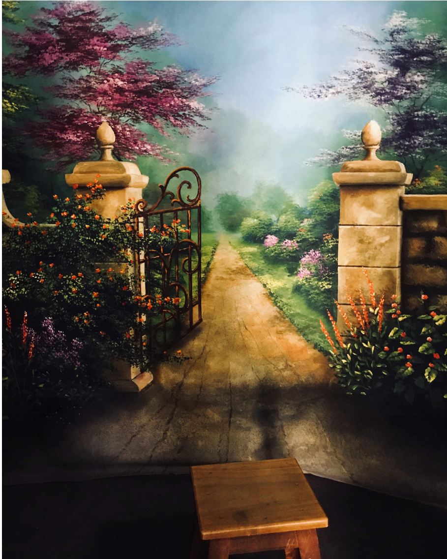
Figure 23 Painted studio backdrop at a Jaffna studio. Rendered in a style midway between what in European Art History might be categorized as Late Baroque and Impressionism, Jaffna's picturesque studio backdrops evoke the scenery of unidentifiable Mediterranean coastal towns or summon the opulent imagined interiors of English manor houses. These did not reflect recognizable features of a local built or natural landscape, or the modern imaginaries

offered by studios elsewhere in South Asia, but fanciful visions of an unfixed elsewhere for a studios' patrons to inhabit. Even as conventional studio portraiture falls out of fashion in favour of extravagant outdoor shoots, the residents of Jaffna continue to seek out the fantasies of these backdrops, as well as studio photographers' kai rasi or 'lucky hands'.