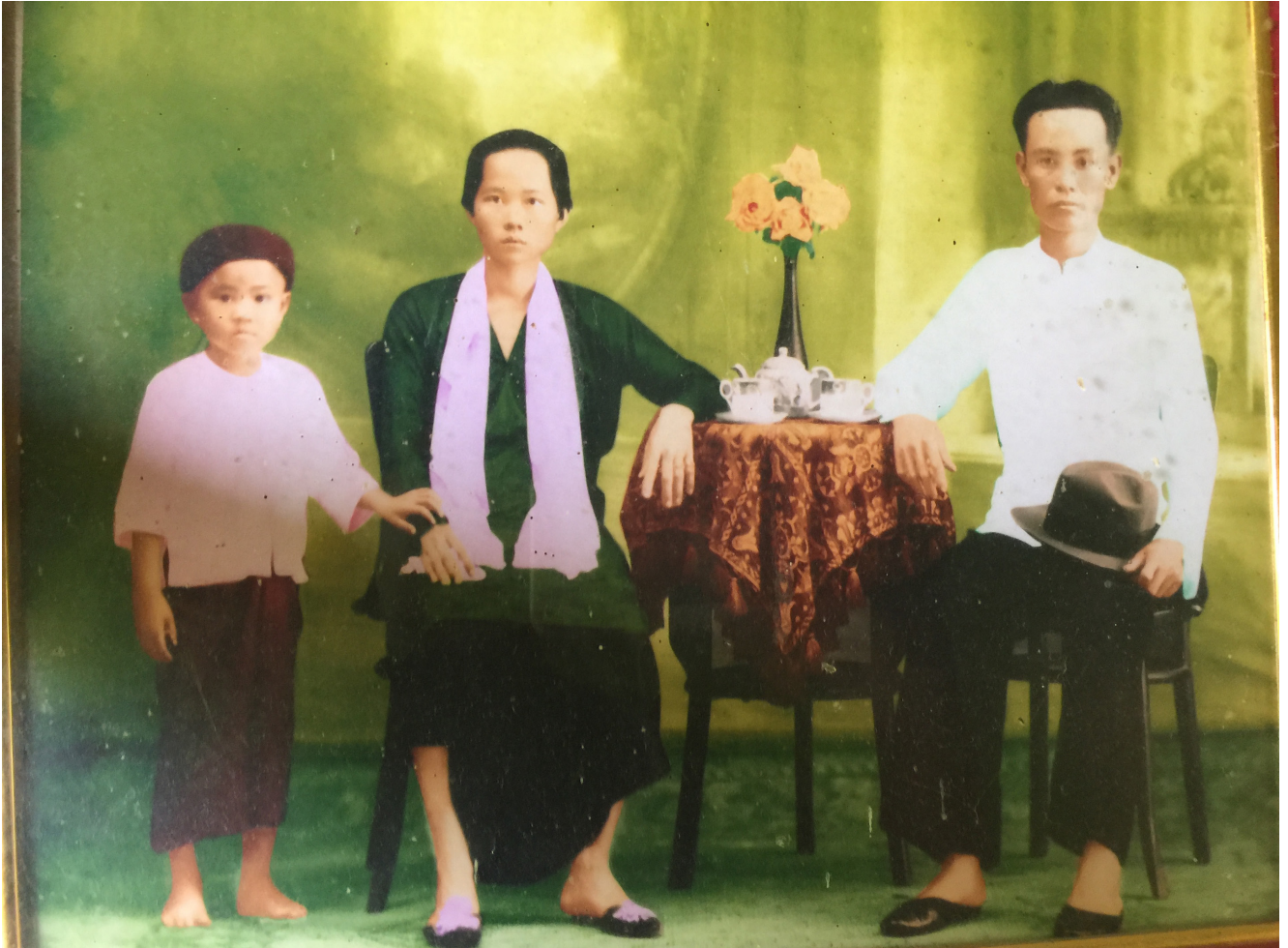
Figure 24 Colourized photograph of a Chinese migrant family, c.1930s. Taken in a photographic studio in Phnom Penh during the French colonial period, the photograph was 'upgraded' from black and white in order to reprint and share with relatives (years after the subjects in the image had passed away). To recall Roland Barthes' Camera Lucida , it exemplifies an elongated 'anterior future'(1981:96)

and embodies the ambivalent temporality of photography. It survived through apocalyptic and political calamities, from peace to war, from war to genocidal regime, and to peace again. It is a treasured photograph archived by descendants, and is also an indication that photography was not accessible to everyone, especially rural Cambodians.