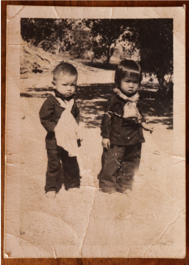
Figure 8 Children of cadres of the Khmer Rouge, Cambodia (from a family photographic archive). This photograph was taken in the 1970s. The country was thrown into civil war (induced by the regional geopolitical turbulence associated with the US–Vietnam War). In 1970 a pro-US general deposed Norodom Sihanouk. The Khmer Rouge, dissatisfied by the inequality of Sihanouk’s regime, encouraged class-based resistance and then overthrew the general. Khmer Rouge took control of the regime and attempted to eliminate all lifestyle and class differences, levelling the populace to peasant status. Every citizen of Khmer Rouge was expected to work in rice fields. The photographing of individual citizens under Khmer Rouge rule was very rare, as the camera was generally only used to document the leaders’ activities, and to make propaganda documents. All Cambodians were ordered to wear black shirts and trousers. Variety in colours was believed to create class inequality. The Khmer Rouge cadres imposed the same dress code on their children.