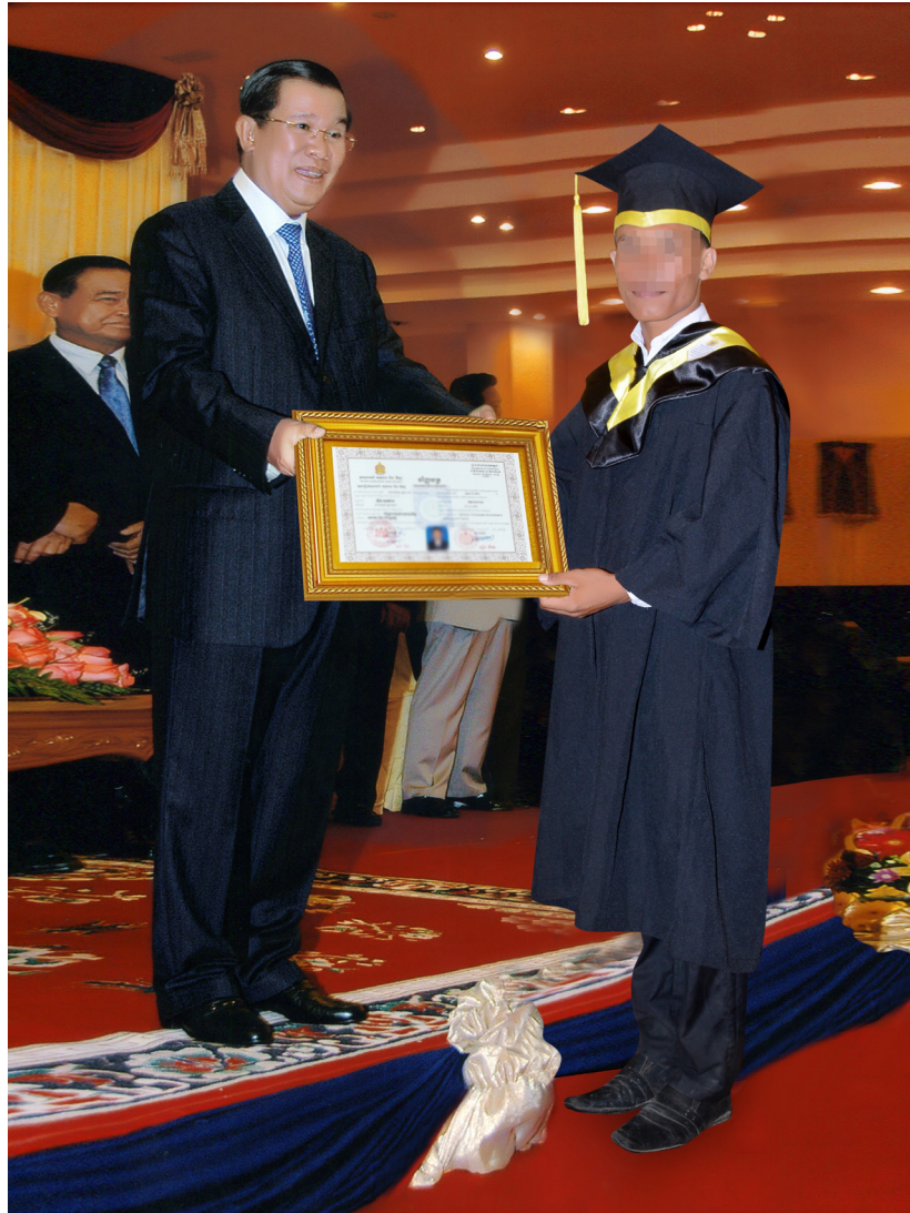
Figure 18 A 'photoshopped' image of a graduate with Hun Sen, the Prime Minister of Cambodia. Believing that being photographed in the presence of a powerful figure will bring fortune and facilitate a flow of power, many Cambodians desire such images. In an official event or ceremony like a graduation, not many students are fortunate enough to be photographed with the premier, unless they

get the highest score or are recommended by the university rector or chancellor. This economically impoverished graduate paid a photographer to use software to depict him with Hun Sen. A photograph like this would be displayed in the home or office, to show relatives and friends one's indexical connection to power.