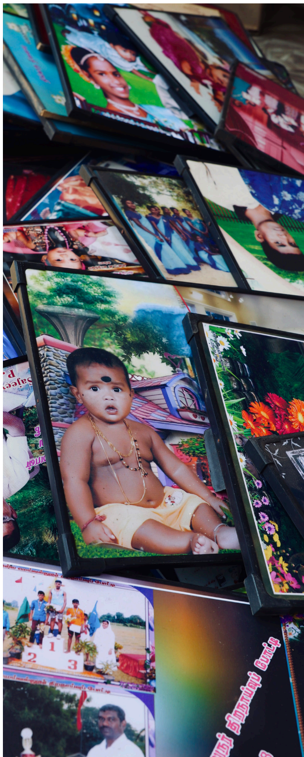
Figure 10 Frame shop remains, Kilinochchi, Sri Lanka. War and displacement amplified the precarity of personal images. Studios and framing shops became the keepers of uncollected photographs abandoned over the years, as their owners were scattered across the island or beyond, at best; or killed or disappeared, at worst. Where personal photographs were commonly destroyed by war or lost on account of multiple displacements, these chance repositories highlight the role of image-makers in the safeguarding of social histories imperilled by conflict.