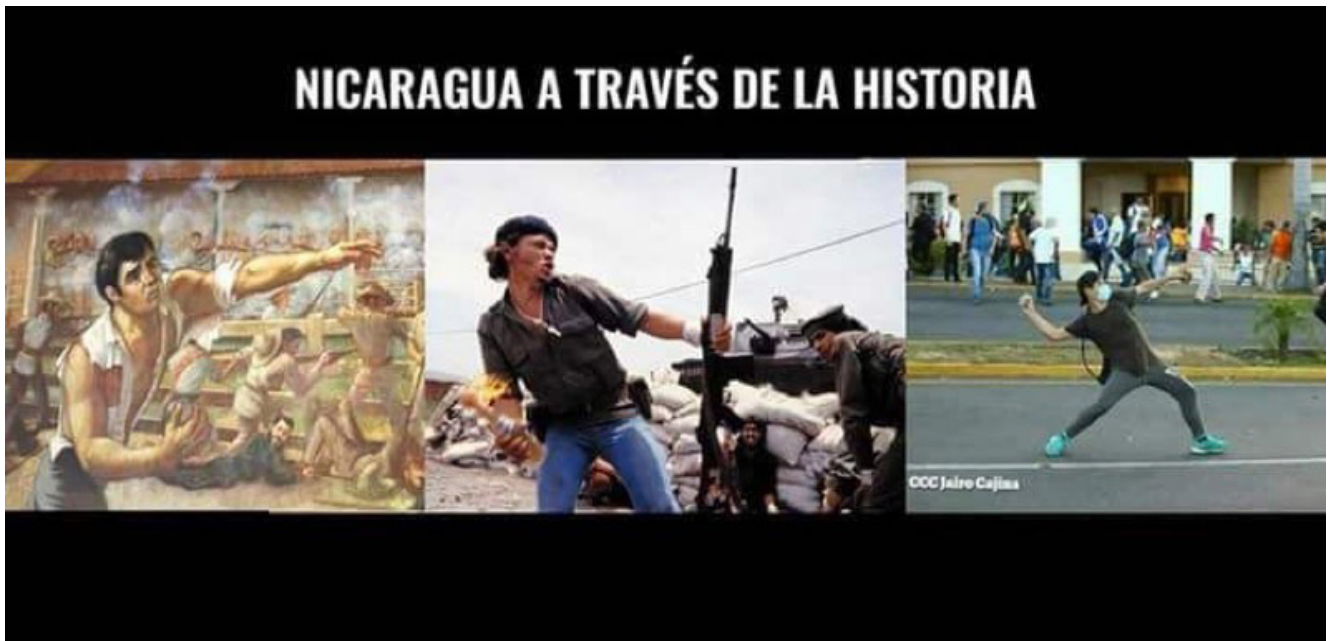
Figure 19 Nicaragua, 24 April 2018. An affective archive was made and remade, as events unfolded. Nicaraguans spoke of the repetition of past conflicts and events, specifically from the historic insurrection of 1978–9, reflecting on the coincidence of images and, by association, events. Correspondences between new documentary pictures and well-known images from 1978–9 were tested, as memory was being actively worked with in the streets. This digital montage constitutes one such example. Widely

shared on social media, it shows a timeline of protest in Nicaragua: an image of national hero Andrés Castro, who in 1856 fought against the invasion of US filibuster William Walker (sourced from a 1964 painting by Luis Vergara Ahumada), juxtaposed with Susan Meiselas' iconic Molotov Man photograph from the historic Sandinista insurrection, taken in 1979 in the town of Esteli, and a contemporary image taken during an April 2018 protest in the capital city Managua.