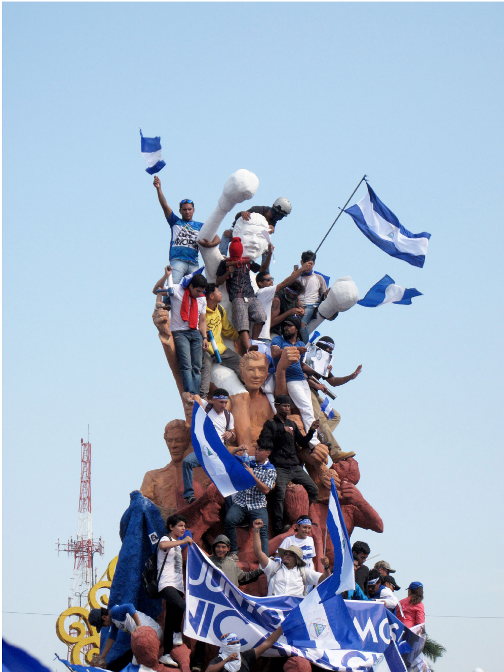
Figure 20 9 May 2018, Managua, Nicaragua. During one of the largest marches organized as part of the 2018 protests, people gathered around the monumental statue of Alexis Argüello, a famous boxer, former mayor of Managua and vocal opponent of the Ortega regime. His death, still un-explained,

has in recent years become symbolic of the regime's impunity. For many hours that day, people scaled the monument, holding flags, signs and pictures of the victims of government repression. Photograph by Ileana L. Selejan, 2018.