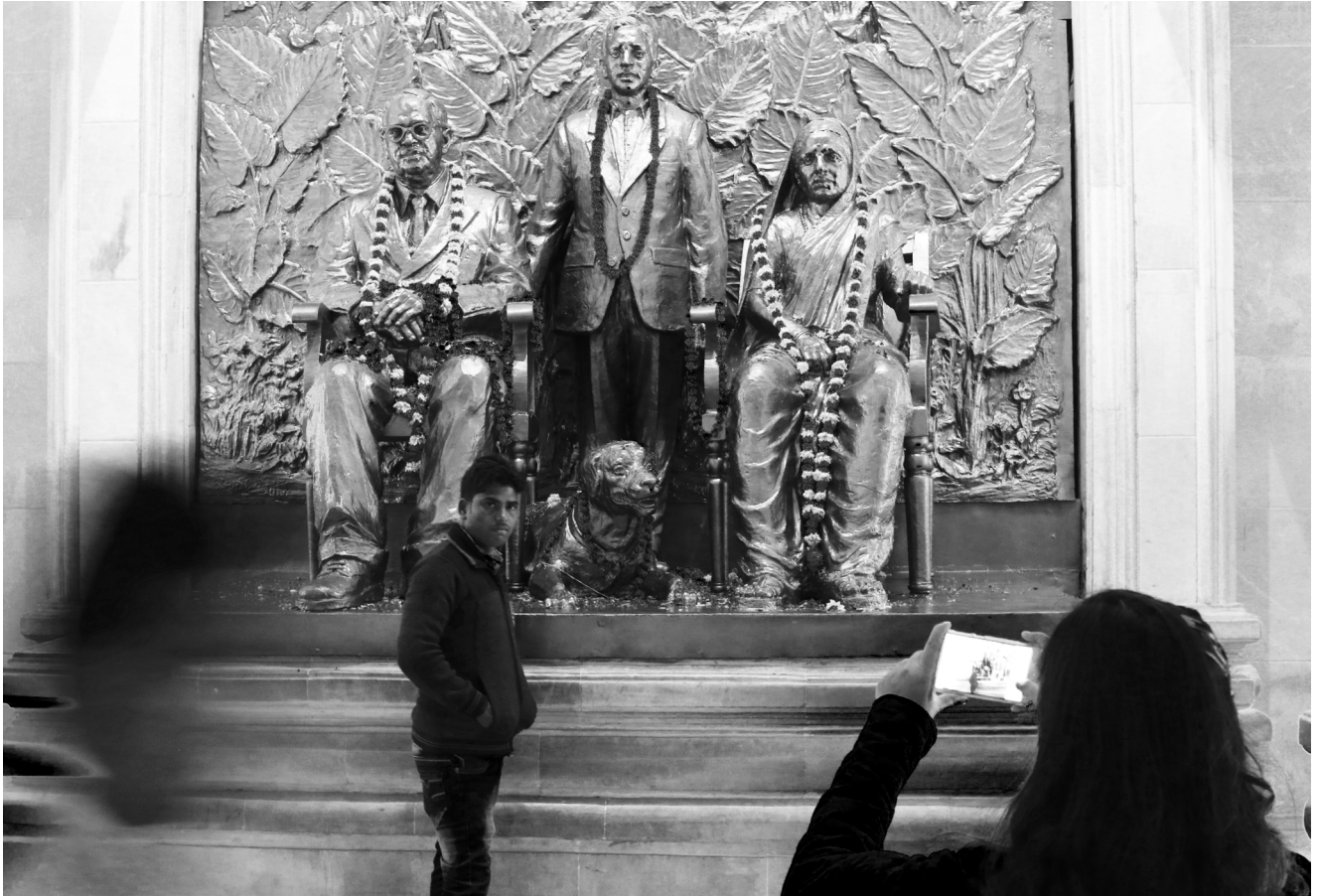
Figure 6 Visitors to Ambedkar Memorial Park photograph each other on the occasion of Ambedkar Jaynti (Ambedkar's Birthday), inside the Ambedkar stupa, Lucknow, 2018. Bhimrao Ambedkar (1891–1956) was the twentieth century's leading Dalit thinker and politician. In the current century he has become the figurehead of a newly energized social movement. Initiated by Mayawati, the former Dalit Chief Minister of Uttar Pradesh, Ambedkar Park covers 108 acres and is a monumental work of public architecture. The sculptures inside the stupa are

modelled on photographs (here showing Ambedkar on the left, Kanshiram in the centre and Ambedkar's wife Ramabai on the right) which now form part of a sacred iconography. The trajectory from analogue photograph to sculpture to digital image alerts us to the protean, ever-changing nature of photography. The Ambedkar Memorial Park, especially the interior space of the stupa, is a sacred space for Dalits. Here a conventional political identification is propagated and affirmed through photography.