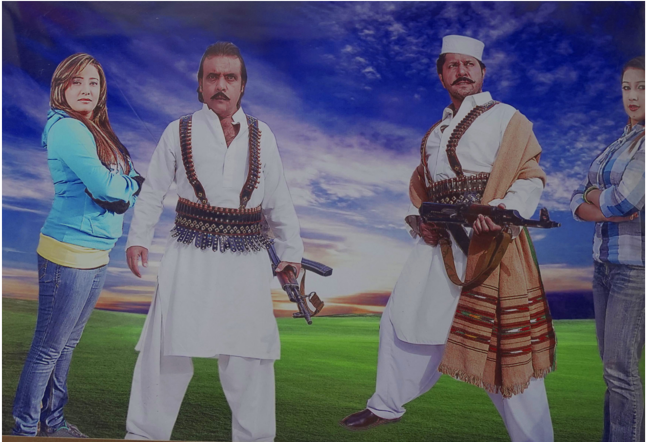
Figure 25 Image depicting four Pashto film stars, displayed in AYR Digital Studio, Peshawar, Pakistan. The two males are well-known actors, Jahangir Khan and Abras Khan, giving body to the Pakhtun observation that guns are a form of 'male jewellery'. The identities of the two females are unknown. AYR Digital is located on Cinema Road, and serves film fans who arrive seeking montages that place them near to their film heroes. Re-photographed by Danial Shah, 2021.