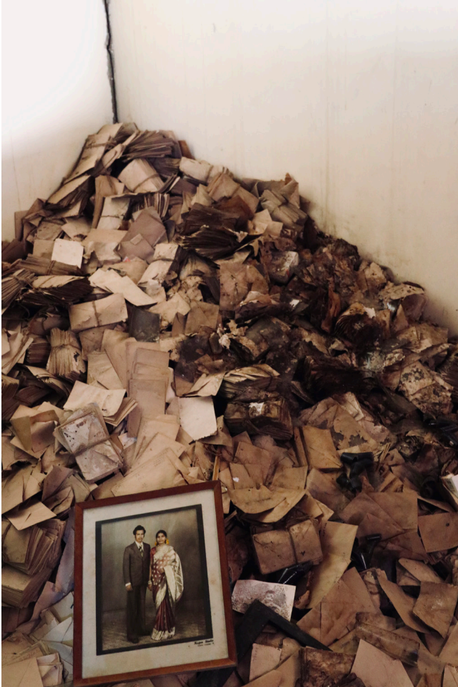
Figure 2 Photographic remains at a Jaffna Studio, Sri Lanka. Decades of war have shaped the visual-material trajectories of everyday photographic practices in northern Sri Lanka. Studio archives ruined by war offered rich insight into the ways in which conflict shaped the Tamil social world. Despite the advent of mobile-phone photography, Jaffna's studios persist. Photographs produced extend from state-mandated National Identity Card and passport headshots to fantastical portraits captured against painted and photoshopped backdrops that conjure for the studio's clients the possibilities of elsewhere. Such everyday photographs not only mediate popular aspirations for migration, but help replicate the romance and possibility of South Indian Tamil cinema. Photograph by Vindhya Buthpitiya, 2018.