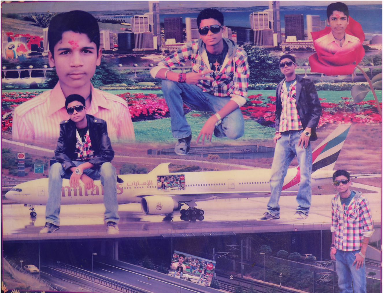
Figure 26 Elaborate photomontage of a prospective migrant from Birgunj, Nepal, visualizing a future in the Persian Gulf. Photography is frequently used to record or imagine mobility. Historically, bicycles were frequently brought into the studio. Then studios started to use motorbikes as a prop. In turn, the studio itself became a staging space for travels in airplanes and automobiles. Frequently, this was tied to the desire and/or necessity of transnational migration. Such images speak to the aspirational and subjunctive space of the photography, actualizing what-is-yet-to-be. Re-photographed by Christopher Pinney, 2019.