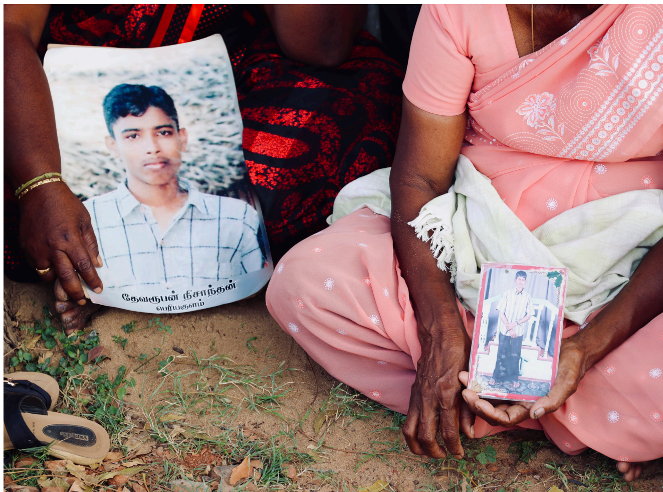
Figure 12 Memorializing State Violence, Jaffna. Within the fraught politics of nation, state and citizenship in post-war Sri Lanka, these personal photographs have been mobilized within acts and spaces of political resistance and claim-making linked to accountability and redress, visually enumerating individual lives lost to state violence. Where state atrocities against Tamil civilians have been glossed over with cinematic narratives of 'triumph' and the 'defeat of terrorism', these portraits were actively wielded to amplify the visibility of protest. Photograph by Vindhya Buthpitiya, 2018.