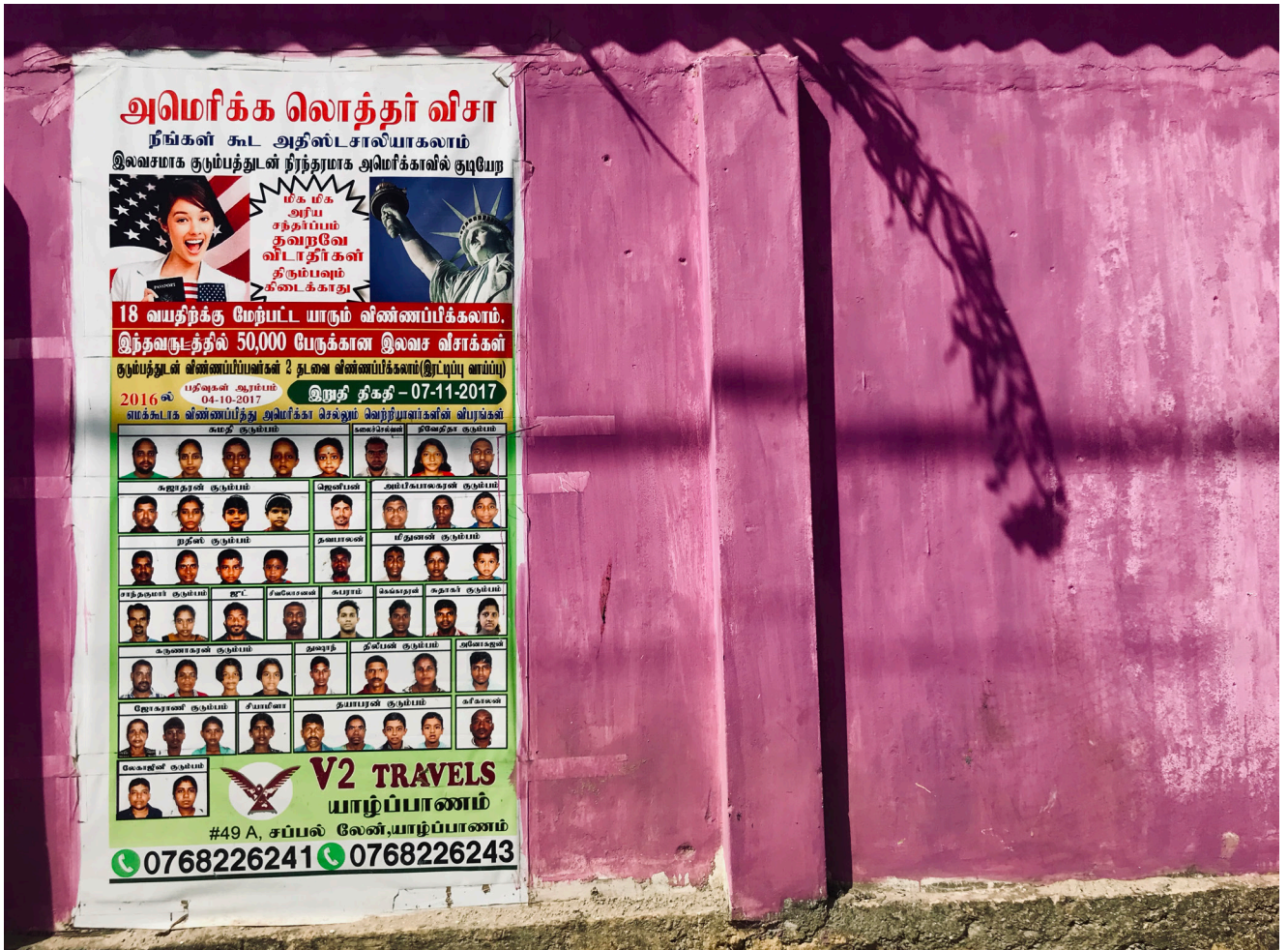
Figure 30 Visa photographs of those who successfully obtained American green cards displayed by an immigration consultancy, Jaffna, 2018. As a consequence of war, new modes of photography were developed in order to respond to the effects of impaired citizenship. Photographers became facilitators of their clients' anticipated futures. Some studio practitioners were sought out because of their kai rasi or 'lucky hands'. They helped mediate new kinds of aspirational citizenship

by way of marriage-proposal portraits, passport and visa photographs, or the artful compilation of wedding photographs and albums to satisfy Western immigration/border regimes. These desired futures, partly brokered by photographers and photographers, reflected the lingering effects of war on citizenship, combined with the possibilities for mobility afforded by the Tamil community's transnational displacement and dispersal.