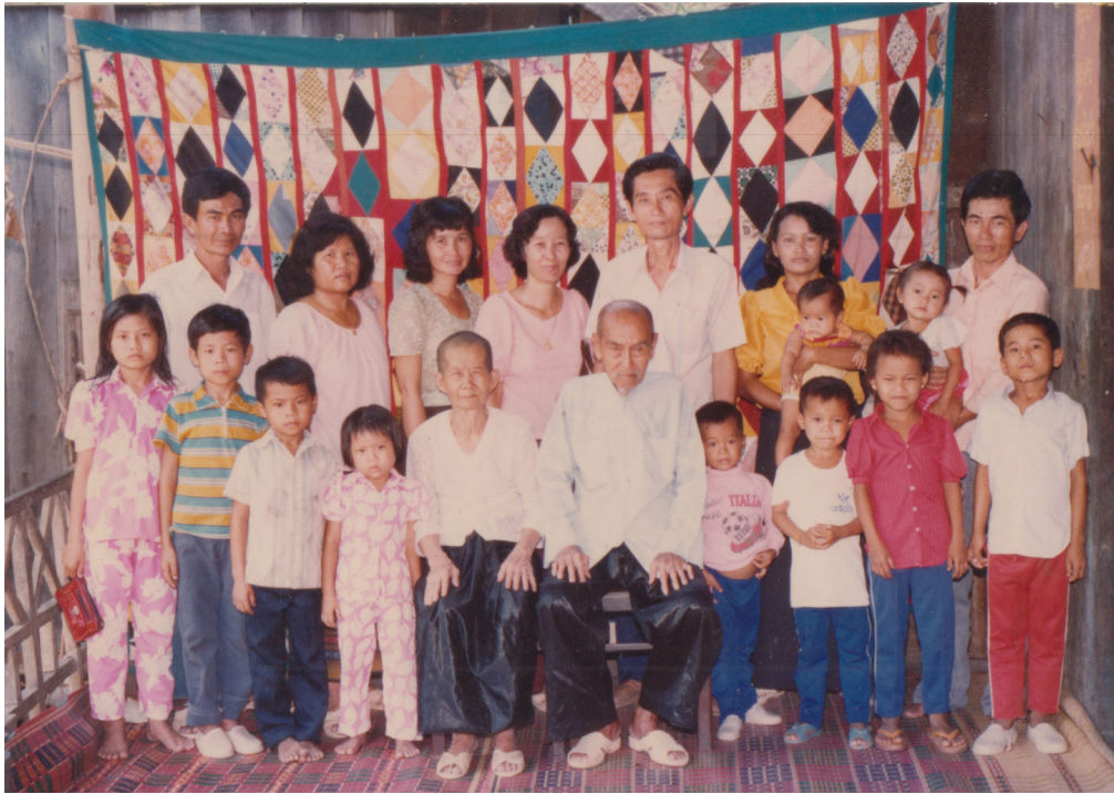
Figure 29 A family reunion after the Khmer Rouge, Stoung district of Kampong Thom, Cambodia, 1989. During the Khmer Rouge regime, about two million people died, as a result of starvation, forced labour, illness and execution. Trust within and among family members was fragile, as children were encouraged to spy for the Khmer Rouge, and to report misconduct such as stealing food. Without proper investigation, the accused were routinely executed. Family members were deployed to work in different parts of the country, and they were unable to communicate concerning their livelihoods and conditions until the regime was overthrown by the Vietnamese troops in 1979. This photograph records a family reunion of two brothers who lived apart from 1970 to 1988,

without knowing that each of them had survived and also had family and children. Photographed just after they met, one part of the family (from the Thai-Cambodia border) had to travel at least five days to reach the Stoung district of Kampong Thom. The colour of the backdrop and the outfits of the children depict a new form of integration, reunion and celebration. Contrasting with the black and white of the Khmer Rouge outfits, the variety of coloured apparel in this photograph can be read as a form of 're-civilization' in the post-genocidal regime, where survivors like those in this photograph liberate themselves from the black and dark colours (of sadness and terror) imposed by the Khmer Rouge. Re-photographed by Sokphea Young, 2018.