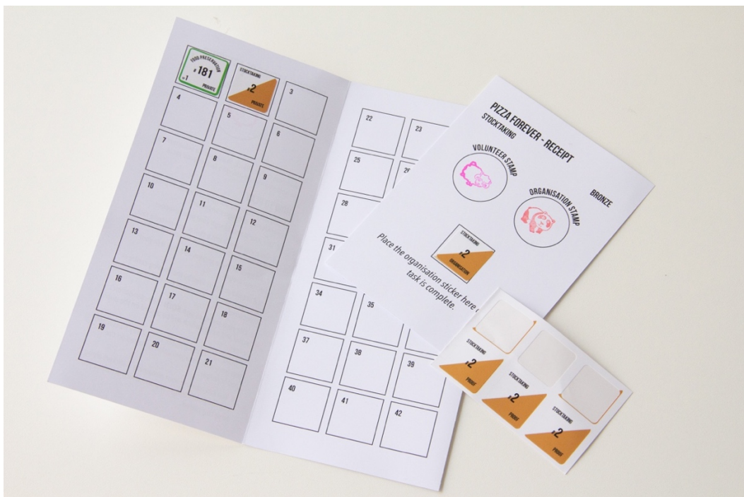
Figure 3: A volunteer's private ledger, with a chronological record of each transaction resulting in a skill or task sticker. Proof stickers are held in the wallet and can be selectively shared with a stamp, in order to prove their skills.