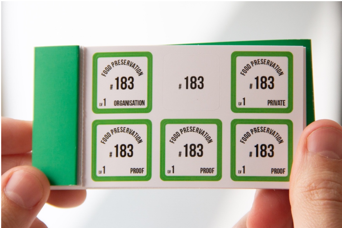
Figure 2: Unique set of stickers given to a volunteer for each skill or task they complete. Organisation stickers are kept by Training Centres or Social Enterprises; the white sticker is placed on the public ledger; private stickers are for a volunteer's own wallet; and proof stickers can be used to prove skills to other players in the game.