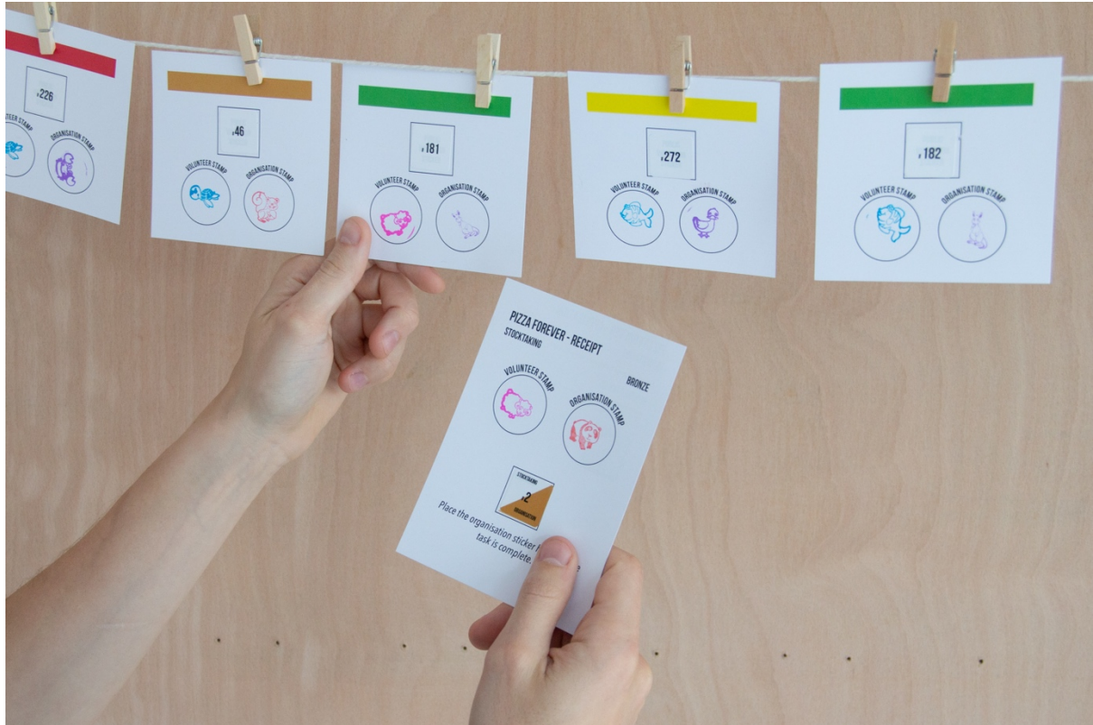
Figure 1: Example of the public ledger washing line. Numbered stickers reference unique transactions, and can be used to validate claims made by players of the game.

de minimis personal information only – sufficient to prove they are eligible to volunteer for a certain task, but no more. This ability to share relevant and narrow information as opposed to broad and unnecessarily comprehensive personal information offers volunteers the prospect of exercising greater control over their data.