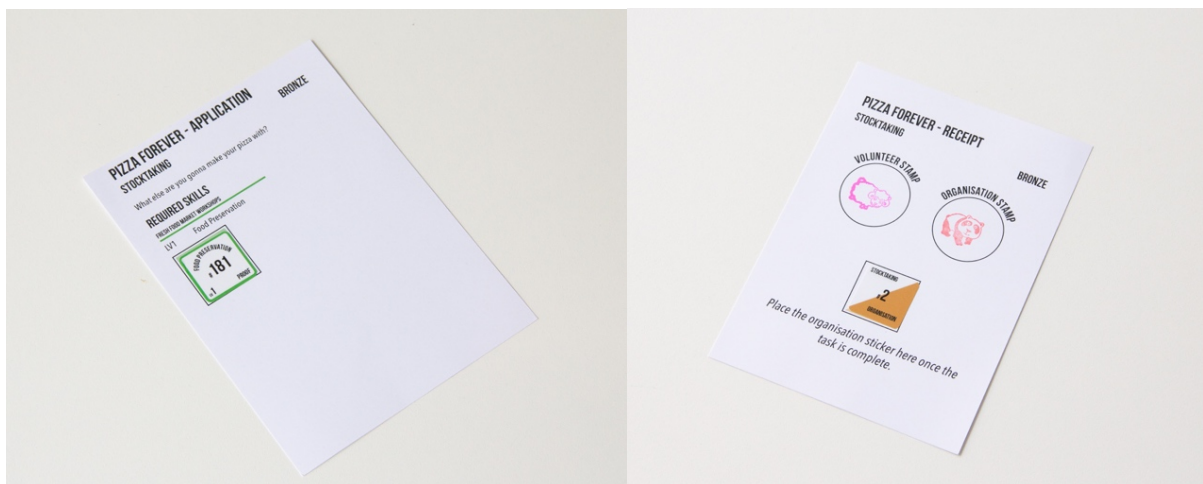
Figure 5: The Social Enterprise record. On one side, the task description, and required skills. On the other, a receipt stamped by both volunteer and organisation, and the task sticker awarded to the volunteer for their experience.