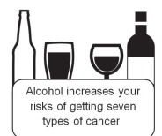
FIGURE 1 Alcohol health warning labels presented to interview participants

You are more likely to die from heart disease if you are a heavy drinker