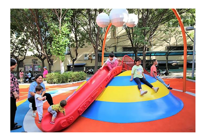
Fig. 9. The "refining" space

As time goes on, the city will face many problems of the new era in the process of development. Based on the