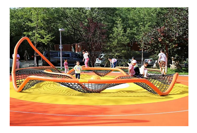
Fig. 7. The "melting stage" space

These areas are still complex cultural experience spaces for the elderly and children. The concept is combined with the steps of the "melting stage" and "dephosphorization stage" in steelmaking (Figs 7 and 8). The floor of the fitness trail area for the elderly is paved with pebbles to provide the elderly with the function of slow walking massage. Peripheral with children swing experience facilities. The wind-