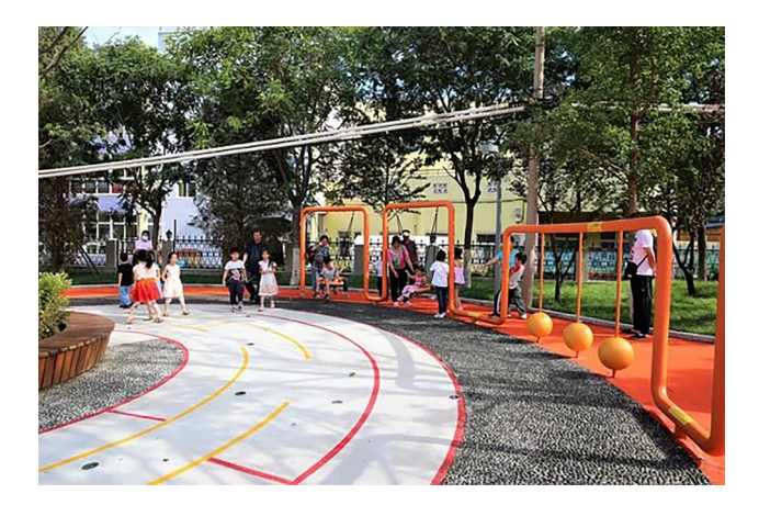
Fig. 8. The "dephosphorization stage" space