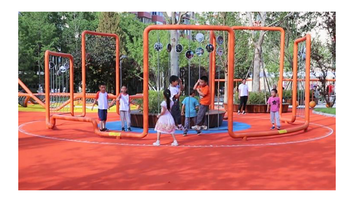
Fig. 10. The game area and "Memorabilia" area