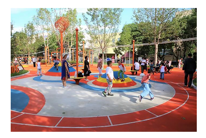
Fig. 5. The "melting tank stirring" space