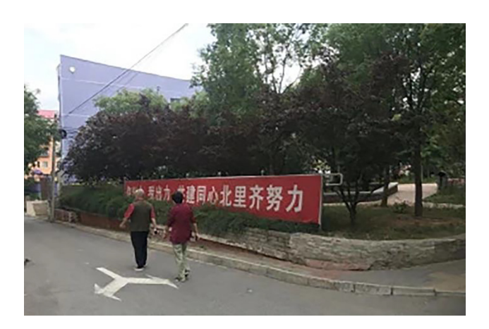
Fig. 2. The site situation

After visiting residents, the design team concluded that residents are concerned about the inheritance of Capital Iron and Steel Company's memory. Adults want their children to remember and live closely with Capital Iron and Steel Company, which are cultural feelings. How to reflect these memories of manufacturing iron and steel in this space and make space play a greater role is the problem we need to solve.