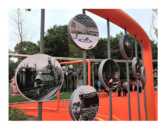
Fig. 11. Old photo of the area

existing urban construction, designers should not only respect the existing urban construction, but also make urban renewal to meet the current social needs. In most cases, large-scale demolition and construction are not desirable. In the face of the specific regional problems of the city, it is efficient and low-carbon to realize the revitalization of regional vitality with limited design transformation. Urban micro recovery is the way to compound the urban reconstruction in this era. Through a series of means of public art, there can make limited adjustments to the space to improve the regional environment and activate the mass culture of surrounding residents. The core of public art is publicity and the public spirit of society. It is not a niche appreciation of the artist or designer himself, nor is it a commercial core purpose. Public art is a kind of art culture that benefits citizens, aesthetically educates citizens, and is conducive to the self-education and growth of civil society.