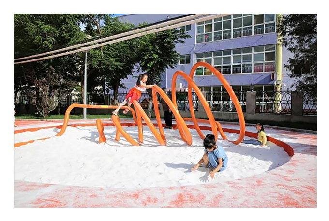
Fig. 6. The "electric furnace low blowing" space

These areas are still complex cultural experience spaces for the elderly and children. The concept is combined with the steps of the "melting stage" and "dephosphorization stage" in steelmaking (Figs 7 and 8). The floor of the fitness trail area for the elderly is paved with pebbles to provide the elderly with the function of slow walking massage. Peripheral with children swing experience facilities. The wind-