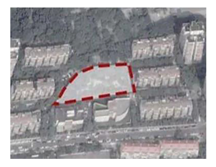
Fig. 1. The range of design

The project site covers an area of about 3000 square meters, the terrain is high in the northwest and low in the southeast. There is an underground parking lot under the site. The main leisure time for residents is from 6 to 9 a.m. and from 2 to 5 p.m.