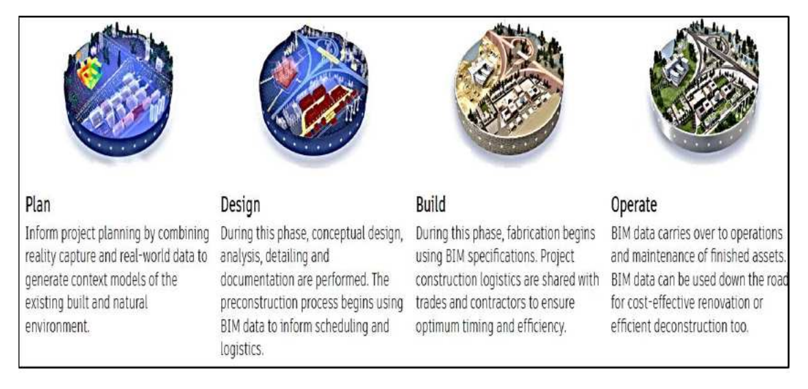
Figure 1 BIM Data Creation Throughout the Lifecycle [16]

Despite the humongous creation of BIM data throughout the lifecycle of building as in Figure 1., the insights derivation is only possible through the appropriate platform. It can get much more complex when the BIM data can be created exceptionally through the integration with Linked open Datasets or different applications within the construction industry [17, 18]. This situation will lead to the incapability of the conventional storing and processing tools which will require another platform to ensure the voluminous data can be managed and utilized [19, 20].