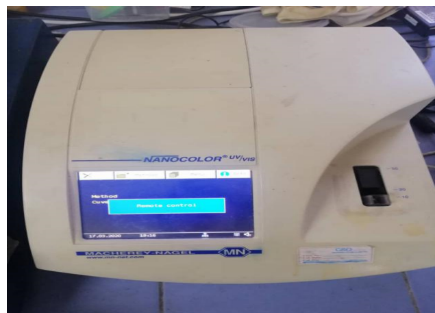
Figure 2 UV-Vis spectrophotometer

left overnight to perform the reduction of metal ions to the formation of AgNPs in the solution. The changes in colour were observed and the solution was checked using UV-Vis Spectrophotometer to determine the success formation of AgNPs (Figure 2).