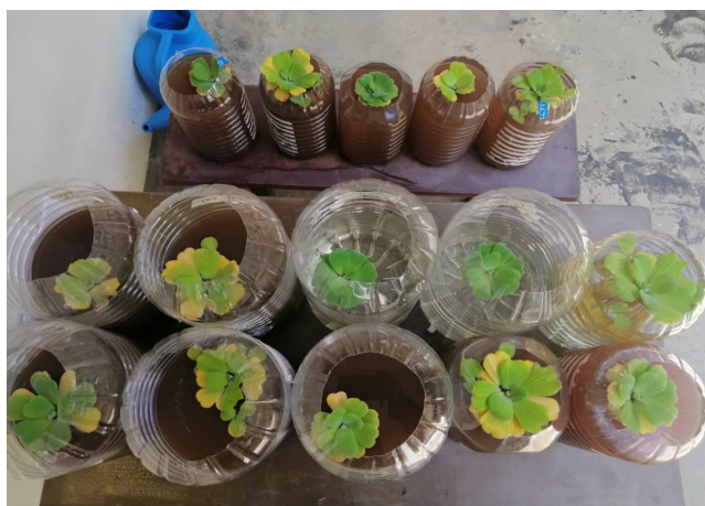
Figure 1 The plants are placed in 5 L of water bottles containing silver nanoparticles

Pistia stratiotes are collected from the pond near the IPASA laboratory and transferred to a quarantined pond before use in experimentation. Muntingia calabura sp. leaves are obtained at the trees around UTM. Plants of similar shape and size are selected for use and washed several times with tap water before use. Plants are placed into different 5 L water bottles (Figure 1). Silver nanoparticles are added to each of the media.