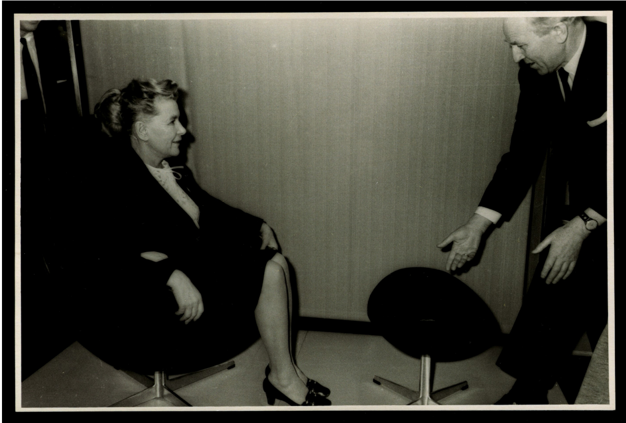
Figure 2. Soviet Minister of Culture Yekaterina Furtseva in chair by Hans Wegner at the exhibition Contemporary Danish Design , 1969.

project's subject and bringing this into contact with various disciplinary contexts. In March 2022, we organized in Copenhagen the workshop "Cultural Diplomacy and Exhibitions," for which we invited art and design historians and historians from Denmark and the Nordic Countries to reflect on the role of recent research on cultural diplomacy in relation to exhibitions of art and design. Building on contacts and experiences from these events, we will organize events (including a Ph.D-workshop in Copenhagen) on the role of exhibitions and how to access exhibitions as research objects and a conference on exhibitions across the Iron Curtain in the