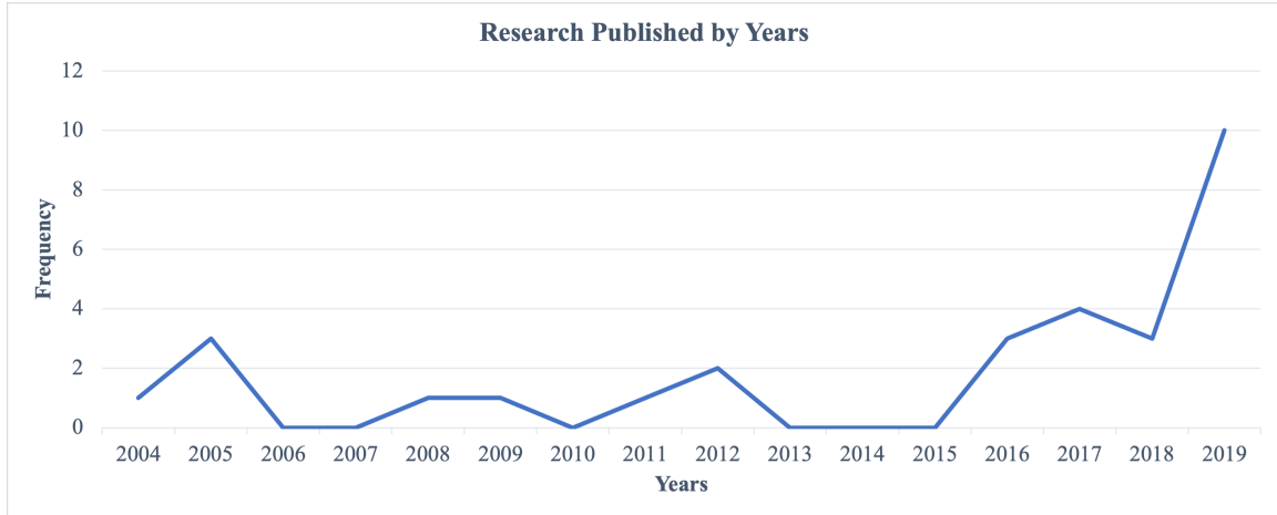
Figure 3: Paper count by publication year – Phase 1

From the above plot of publication count by years, it can be seen that in the years after 2010, the research conducted on this topic increased. In 2019, around ten papers were published over the year.