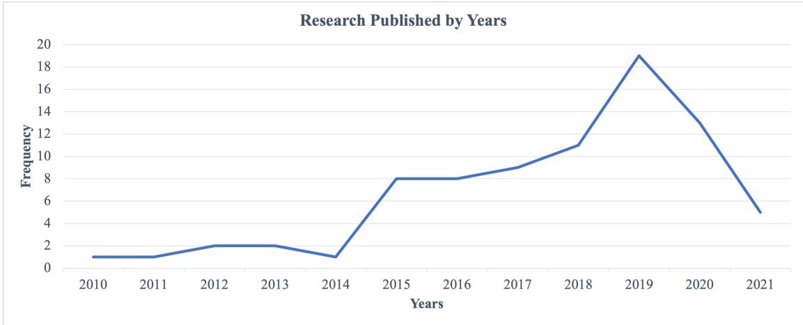
Figure 5: Paper count by publication year – Phase 2

Figure 4 describes the frequency by which the studies were published. There is an increase in research after 2014, with 19 papers being published in 2019. Although the literature search was conducted for years between 1990 and 2021, studies relevant to this review were only conducted in the past decade.