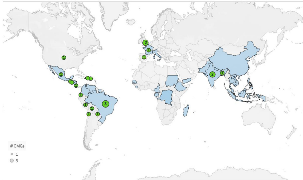
Figure 3. Chikungunya outbreaks (1999–2020) and geographic distribution of identified CMGs. The blue shading shows human Chikungunya outbreaks documented as of 1999–2020. 56 The green dots represent countries with a Chikungunya clinical management guideline (CMGs) and the numbers identified. Additionally, there were three global CMGs produced by the World Health Organisation (WHO), Medscape and Up-to-date, and three regional CMGs produced by the Pan-American Health Organisation (PAHO), WHO South-East Asia (WHOSEA) and Pan-American League of Associations for Rheumatology-Central American Caribbean and Andean Rheumatology Association (ACCAR).

(Map adapted from Bettis, A.A and Jackson L.M et al., Plos NTD, 2022 56 ).