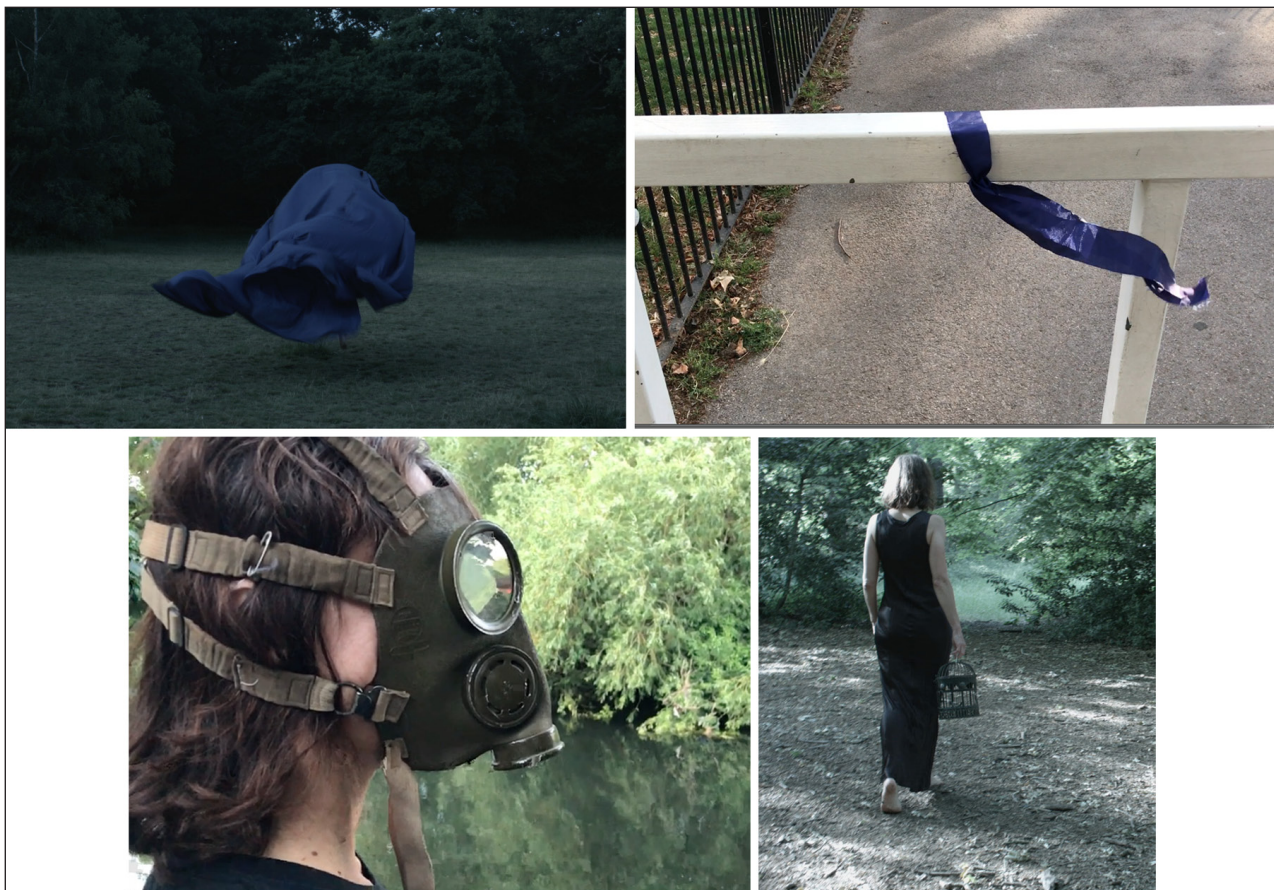
Figure 7a, b, c, d Screenshots: A poetic record. It Takes a Decade (2020), Natasha Davis (with Jane Olson).

The film is divided into ten episodes that reflect what would have been the ten staging posts on the planned