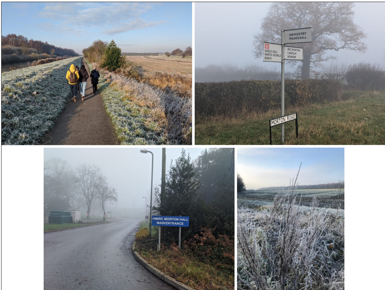
Figure 2b, c, d, e Testing the route to the IRC in November 2019, Mansions of the Future curatorial team.