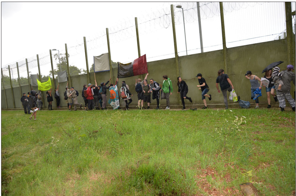
Figure 4 At the Perimeter Fence.