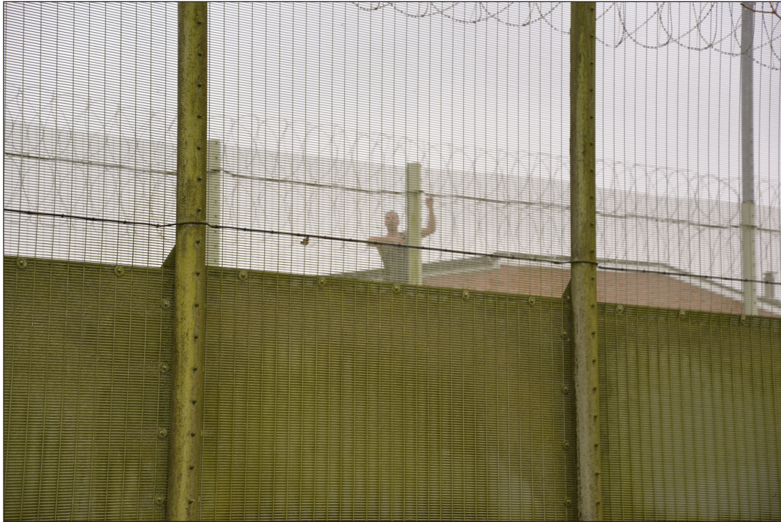
Figure 5a Narumar/Detainee behind the wire, here.

captures the essence of this place and its impact on human relations. Manuchehr's image of one detainee, Narumar, behind the wire (Figure 5a) stands out as an image that exceeds the usual expectations of protest photography. He also supplied a companion image of the same man outside the wire (Figure 5b) on a later date (after his detention was finally proven illegal, he returned