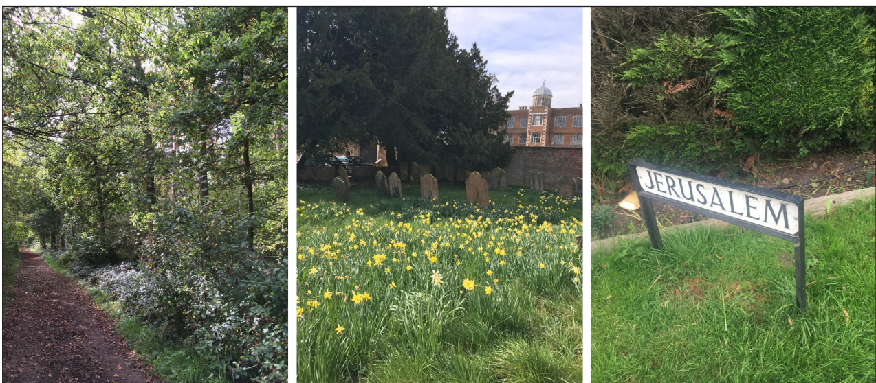
Figure 3a, b, c Walking to Morton Hall in Spring via Doddington Hall (courtesy Hollie L.S. Morgan, 2020).

in 1585, five miles from the prison and a stopping point on the walking route to the Hall. The current buildings at Morton Hall are in no way beautiful or welcoming. They have the dour aspect of any prosaic prison block, enclosed by green metal fences and large quantities of razor wire. Yet, the prison is set in a very beautiful