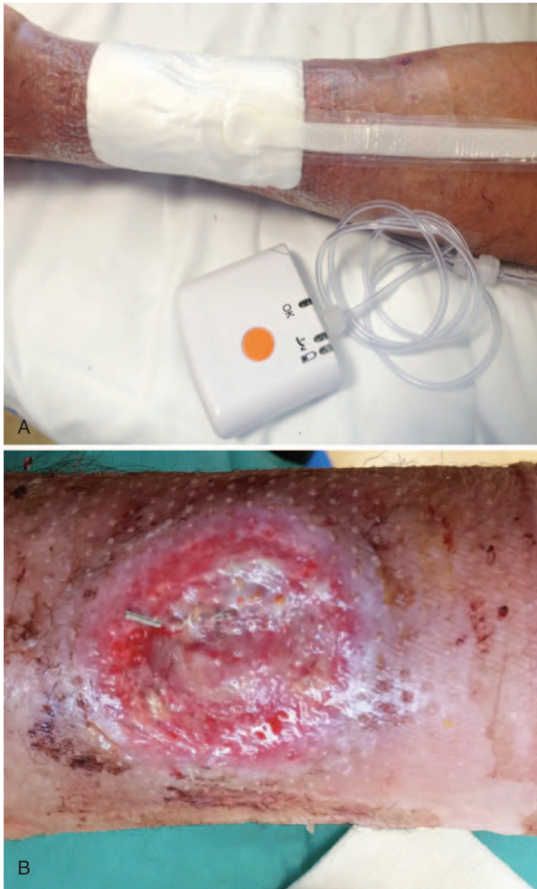
FIGURE 2. (A) The NPWT device on site. (B) The wound as appeared at the time of PICO removal, after 7 days of NPWT. NPWT = negative pressure wound therapy.