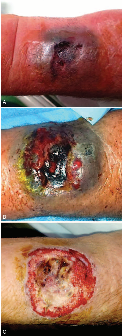
FIGURE 1. (A) Radial artery puncture site at patient readmission. (B) Aspect of the wound 24 hours after broad-spectrum antibiotic therapy. (C) Appearance of the lesion after wound care and specific antibiotic therapy (3 hours before the radial artery rupture).

Three days after hospital discharge, the patient referred a pain at his left wrist. The examination of the radial puncture site revealed an exudating ulceration with an underlying hematoma (Figure 1A). The patient was pyretic (38°C) and referred to have