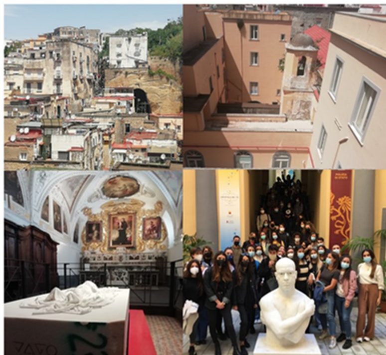
Figure 3. Cristallini 73 in the Sanità district of Naples. Clockwise: view of the neighbourhood, the building, the work of Jago, The veiled son 2019; DiARC students in the first courtyard.

In March 2020, with the involvement of the San Gennaro Community Foundation and the associative network of the Rione Sanità, Cristallini 73 became a community home and hosted engaging and inclusive activities. Transforming an abandoned site into commons is the idea that marks the experience. Thus, a social and cultural sports aggregation centre introduces new lymph into one of the peripheral arteries of the Rione Sanità (Figure 3).