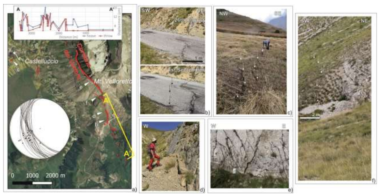
Figure 2: a) map showing of the Mt. Vettore fault area with mapped ground breaks (in red): structural data (displacement vectors and great circles for bedrock faults) and displacement profiles are also reported - Google Earth base image (8/9/2010); b – f) examples of ground breaks: note the typical right-stepping enechelon pattern and the post-seismic movement documented in b).

A set of ground ruptures was mapped in the southern sector of the Vettore fault, along the the E slope of Mt. Vettoretto (Fig. 2a A-A' sector). These ruptures show normal movement (slip vector ca. N240) with a minor leftlateral component, strike ca. N150, and commonly show en-echelon right-stepping. Data on recorded displacement are reported in Figure 2a. Ground breaks run continuously, from the road SP34 (Fig. 2b) at the south end, up to the end of Mt. Vettoretto slope, where the ruptures bend slightly downslope,