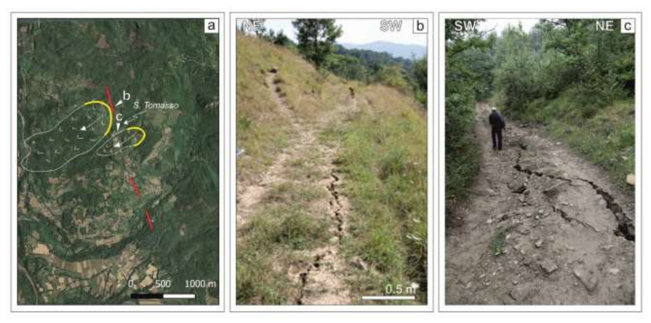
Figure 3: a) map of the Laga fault area: ground breaks are mapped in red; two known landslides are indicated (landslide crown in yellow –IFFI database; <u>https://goo.gl/bE7uTN</u>); b) and c) location are indicated

For instance, in the lower part of the slope between San Tommaso village and the valley floor, several ground breaks were observed (Fig. 3). These fractures follow the slope orientation and consist of 20 to 25 m long surface breaks, 5 to 20 cm wide, N140 - N160 trending and west-dipping. The observed ground breaks are located near the head of a large landslide, suggesting that they may be tension cracks connected to the semicrescentic crown of a seismically-triggered slide. The surface ruptures affect the colluvial deposits covering the area andwe did not observe, if any, evidence of ruptured bedrock . Nevertheless, the affected area corresponds to the zone where, according to In-SAR data, significant deformation occurred (i.e., max. 15 - 18 cm of LOS vertical component near this area, see Figure 1).