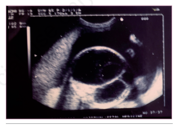
Figure 1. Simple FNOC with daughter cyst.

As reported in literature, the size of the cyst correlate both with the risk of fetal ovarian torsion and with the rate of spontaneous resolution. Even if there is no clear consensus on a defined diame-