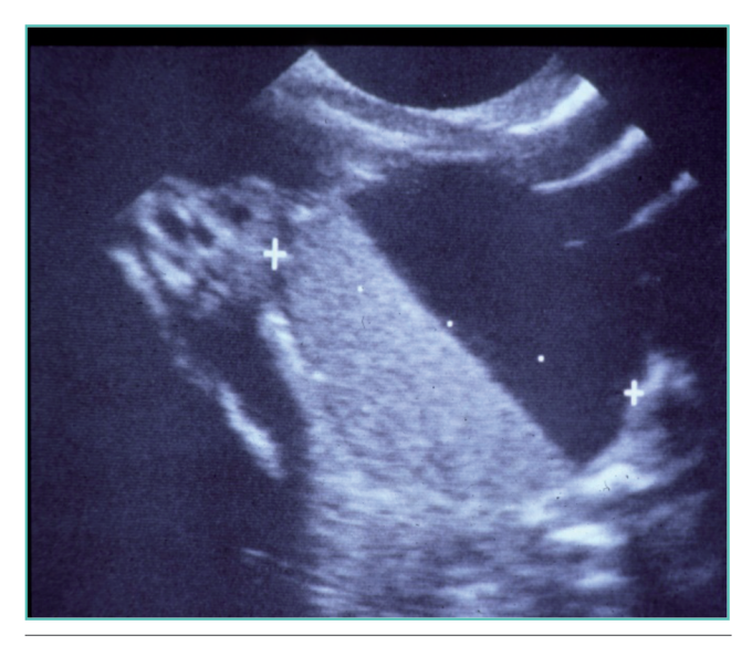
Figure 2. Complex FNOC.