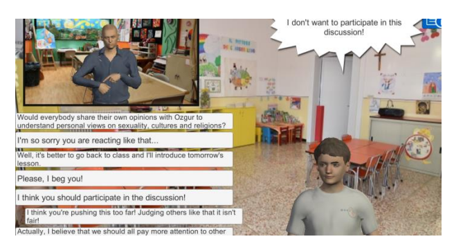
Fig. 2. ACCORD Game: Teacher-student interaction

Within the game process, the user can experience different communicative and conflict management strategies in a protected context. The user is given the opportunity to choose one among five/seven possible sentences based on the five styles of Rahim's Model [13], i.e., covering integrating, compromising, obliging, avoiding, and dominating styles (appropriate and/or inappropriate depending on the situation to be handled) (see Fig.2).