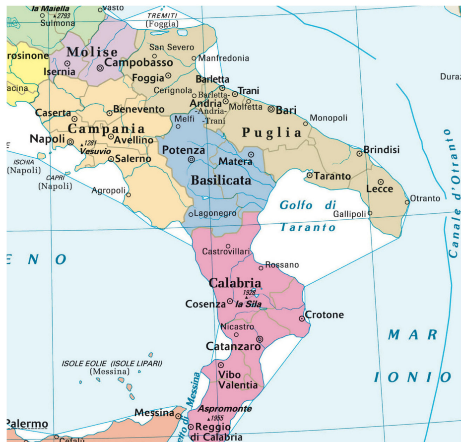
Figure 1. The five regions of the southern Italian peninsula (reproduced with permission from Atlante Geografico Mondiale, Milan, Italy: Touring Club Italiano, 2021).

A multicenter retrospective study was conducted through a cross-sectional survey; the majority of public vascular surgery wards and those accredited with the National Health System (NHS) located in the south of the Italian peninsula were enrolled, i.e., the regions of Campania, Molise, Basilicata, Puglia, and Calabria (population: 12,646,486; area: 62,809 km 2 , Figure 1).