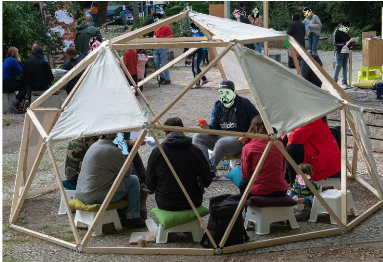
Figure 2. Story-circle. Photograph by Michael Shenbrot and illustrations by Zeynep Keskin. Source: Courtesy of © INTERPART.

yet could be seen from outside. We assumed that people would find it easier to sit down if they felt the space was open and they could decide for themselves when to come and go.