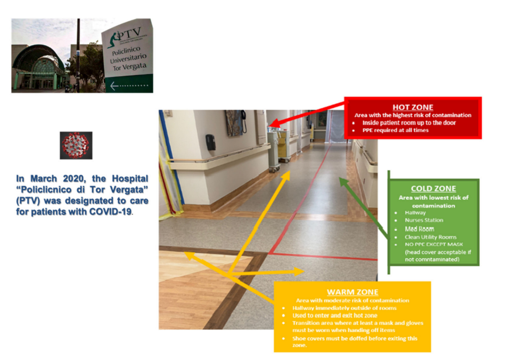
Figure 1. PTV designated as COVID-19 hospital in March 2020.

"Policlinico Tor Vergata" (PTV) is a university medical center associated with the University "Tor Vergata". In March 2020, this hospital was designated to care for patients with COVID-19. Three areas have been created. The Red Areas (Hot Zones), which are the areas with the highest risk of contamination, the Yellow Areas (Warm Zones), which are the areas with a moderate risk of contamination, and the Green Areas (Cold Zones), which are the areas with the lowest risk of contamination (see Figure 1).