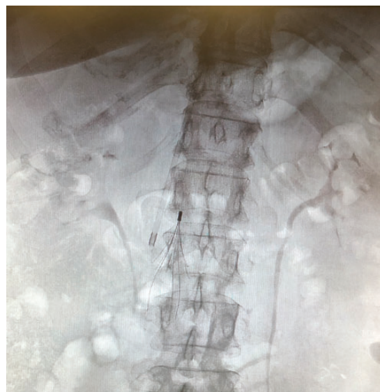
Figure 2. Inferior Vena Cava Filter before surgical thrombectomy.

that despite the use of anticoagulant therapy during the acute stage, PE recurs at a rate of 4,0% to 4,8%. 5 Acute PET was reported to occur within 7 days in 0,5% of patients with deep vein thrombosis (DVT), even though anticoagulant therapy is given 3,5% of patients with DVT complicated by asymptomatic