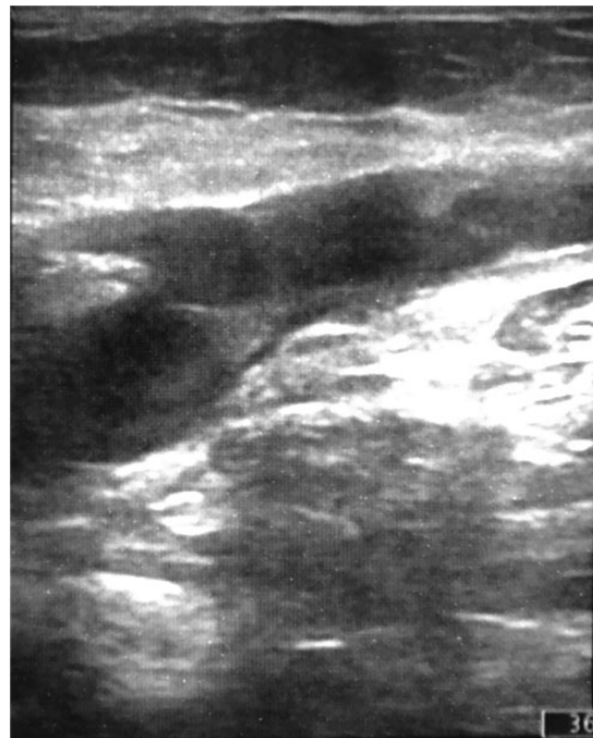
Figure 1. DUS examination of the right lower limb revealed an incompressible great saphenous vein, with no blood flow and with echogenic content (thrombus) in the lumen.

Anticoagulant therapy is the gold standard for the treatment of PTE, 4 nonetheless, reports have indicated