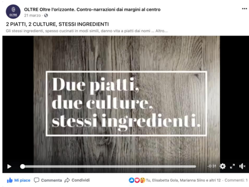
Figure 4. Two dishes, two cultures, the same ingredients, https://www.facebook.com/watch/?v=522285235151784 .

identification of a common enemy (trolls, nationalists, racists) that discriminates on the basis of multiple aspects (identity, religious, cultural, economic, racial). In this way, a possible path of partial integration is started, which could anticipate, however, a “us” that consolidates against someone. The post in Figure 5 is an example of where it is the others who build labels and categorizations and we, therefore, can create a unified front against the others, thus “cancelling out”, for the moment, the differences.