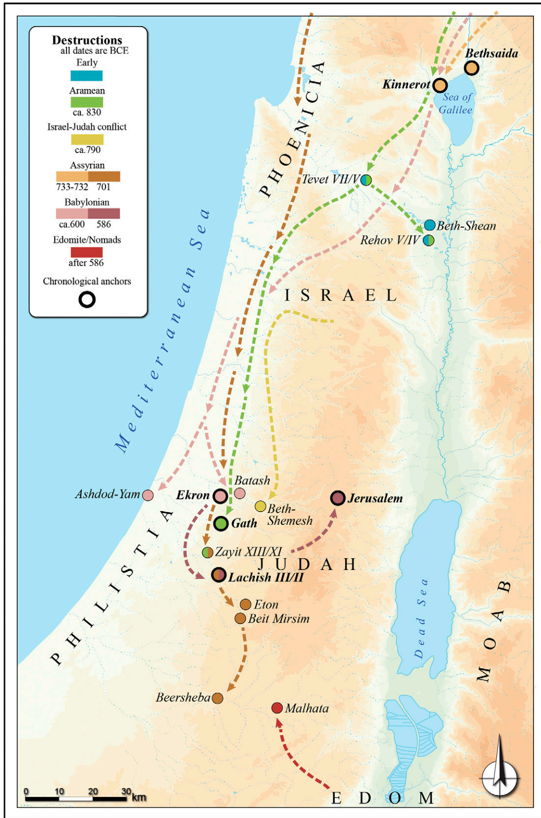
Fig. 2. Map of the studied destruction layers and the different military campaigns. A schematic illustration of possible routes is presented following Rainey and Notley (21). Chronological anchors are highlighted in bold.

Stratum IV or with the earlier Stratum V at Tel Rehov, which included the destruction by fire of unique mud beehives and was dated by radiocarbon to ca. 900 BCE (22). Archaeomagnetic dating of Beth-Shean (Fig. 3A) shows that at a 95% confidence level the destruction occurred before ca. 880 BCE