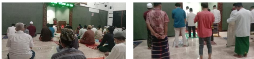
Crossed pattern at Takhobbar mosque, Ketintang (May 9, 2021)