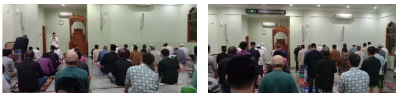
Straight pattern at Al-Hikmah mosque, Kebonsari (May 5, 2021)