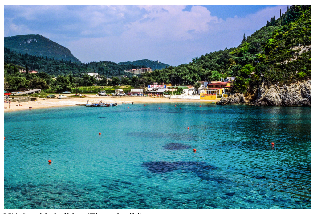
Nº1 Seaside holiday (Thessaloniki)

https://upload.wikimedia.org/wikipedia/commons/8/88/151_GR2230005_SCI_BEACH_02_CORFU_%28By_TRYFON_MANOLIS_THESSALONIKI_HELLAS%29.jpg