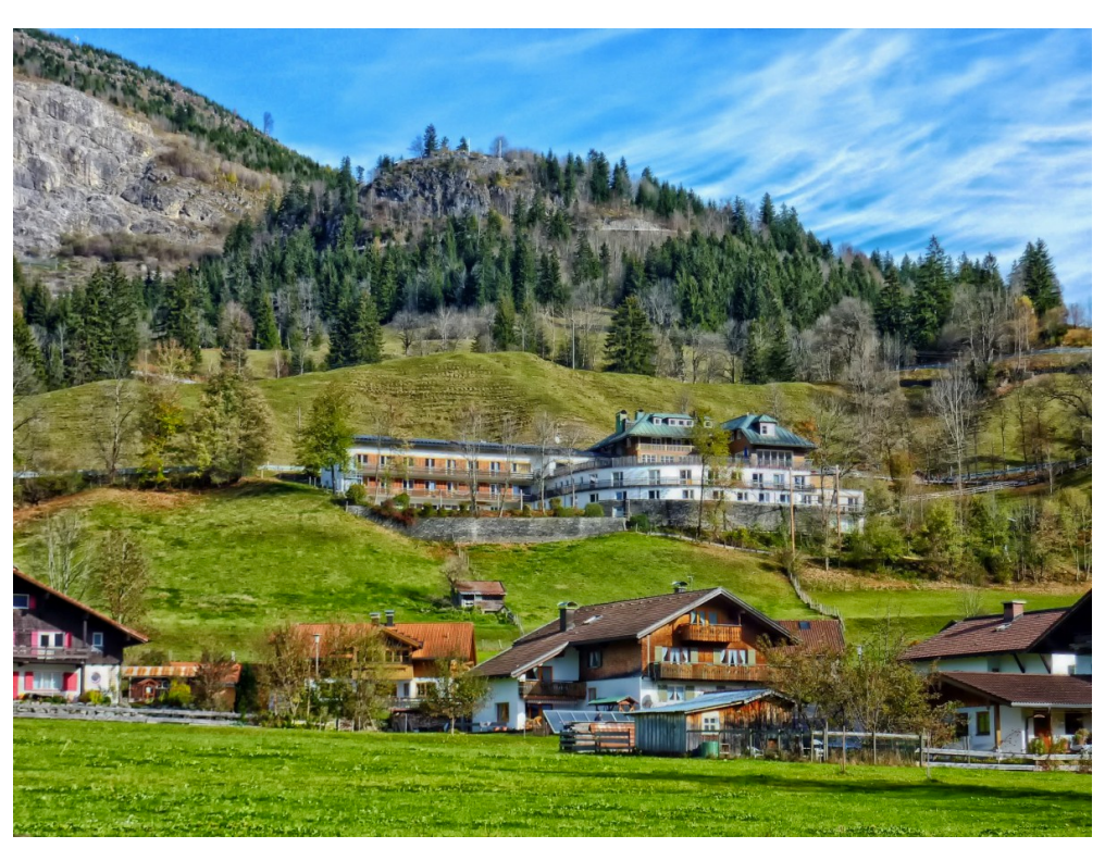
Nº Carpathian mountains (Cluj napoca)

https://c.pxhere.com/photos/80/9d/bavaria_germany_mountains_landscape_scenic_hdr_nature_outside-1342668.jpg!db