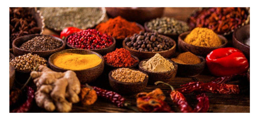
India - Land of Spices