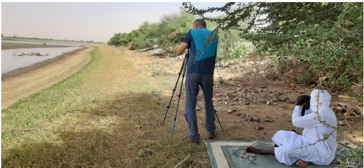
About our Mauritanian guide observing waders from a shady vantage point