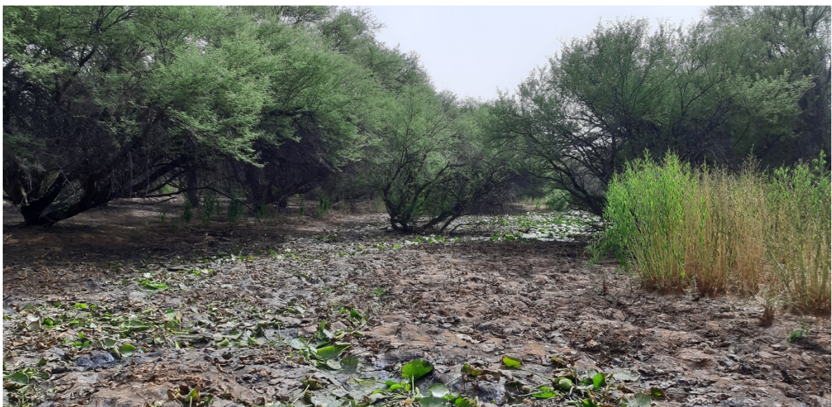
Forest wetland at the lake just south of M23, mostly dried out with a few remaining muddy patches.