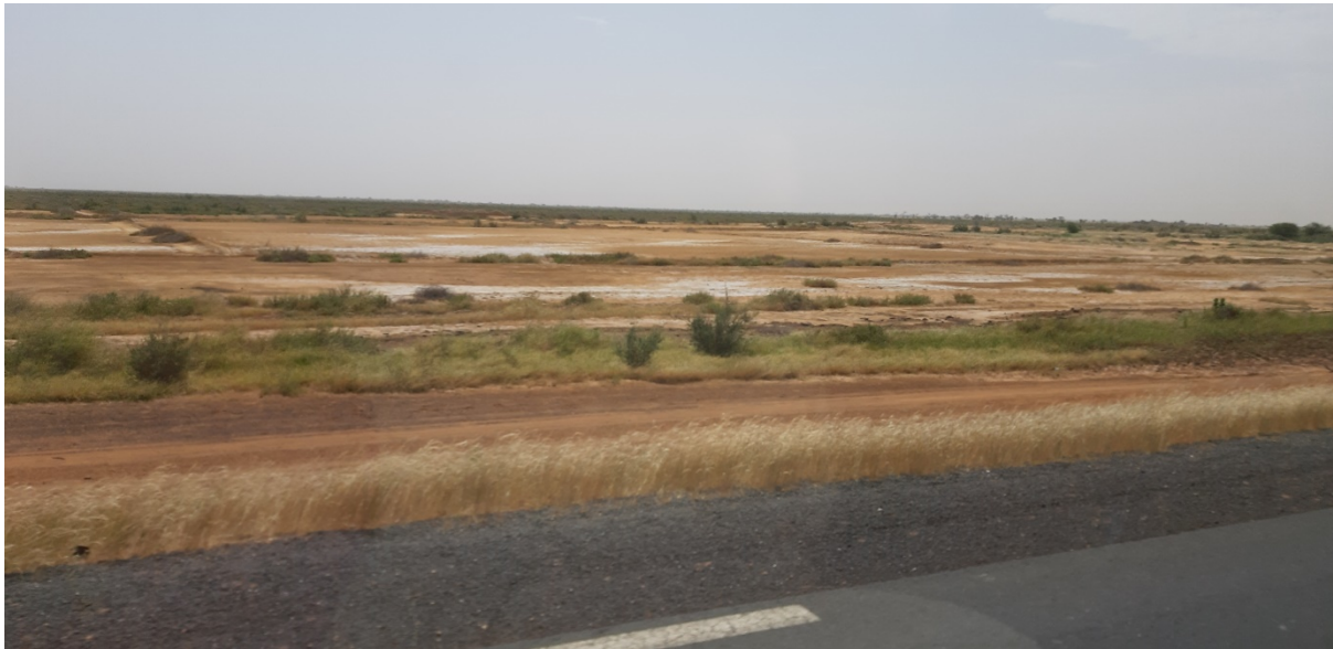
Heading westwards towards Diawling, just after passing through Richard Toll, the receding flood lines of shallow lakes next to the road showed salt crusting, indicating an increase in salinity.

led us through customs and police facilities; quite a difference with the hassle at Rosso! In the afternoon there were just a few hours left for a quick scan of Diawling. This year it has been raining a lot and all the vegetation was still green and grass cover was high: a big difference with the situation we encountered earlier this week at many sites, especially in Senegal suggesting that grazing pressure in the reserve must be considerably lower. It was also striking to see how at ease the birds in the park were because hunting is forbidden; even gamebirds like ducks and geese could be approached at close range, quite a difference with the situation at Ndioum. We visited the site where the German team had seen 150 godwits last week but we only found 2 now. Water quality now shows the closer proximity to the coast increasing to 3.2 mS. We slept at the campsite of Diawling NP.