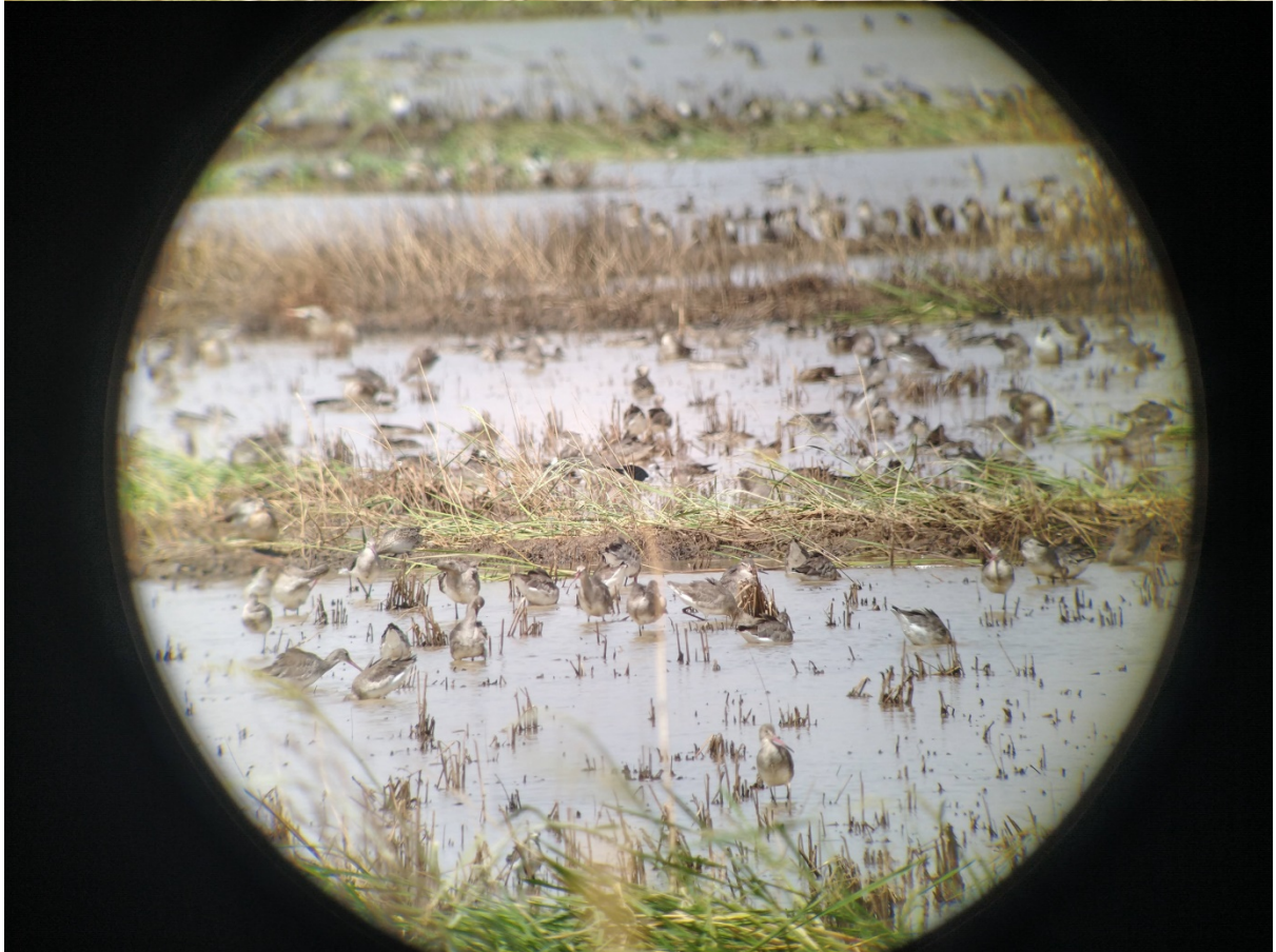
3500 godwits and 5000 Ruffs!!