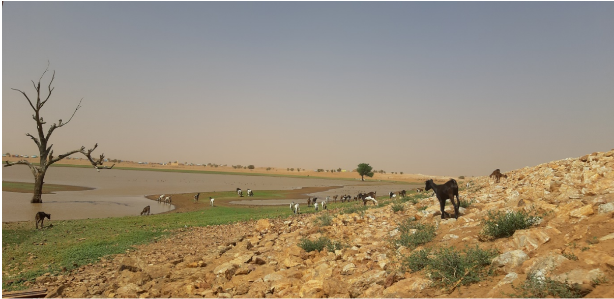
Goats grazing on the green vegetation along the lake edge with godwits foraging in the background.