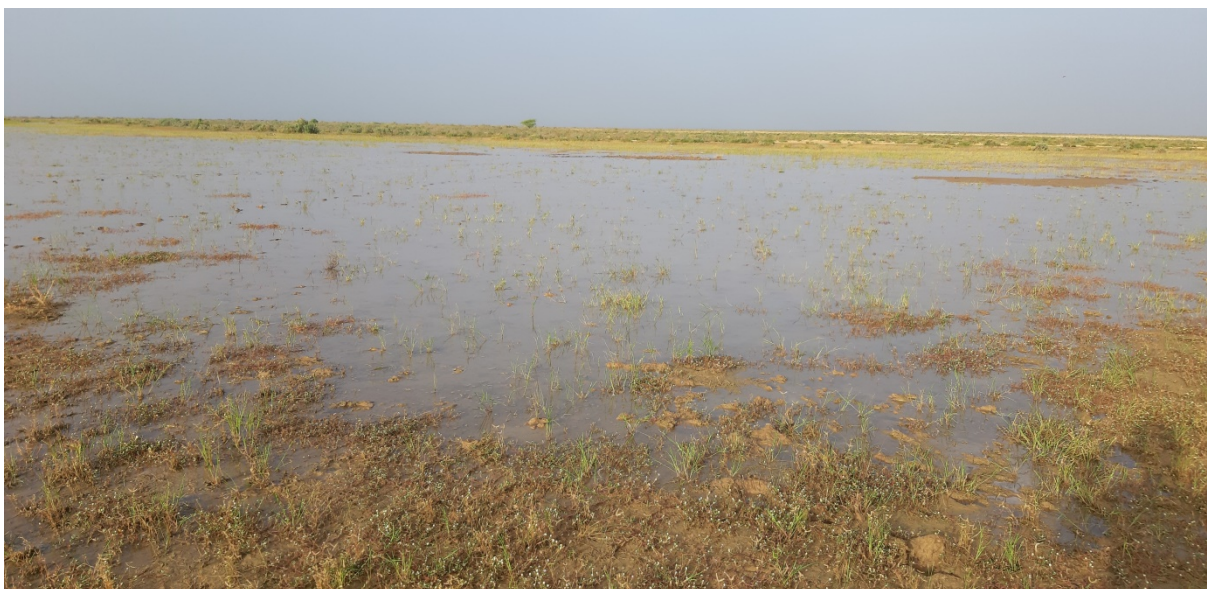
Open landscape with shallow water in the Diawling reserve, where the German team and Zeine had located 150 godwits 2 weeks previous.