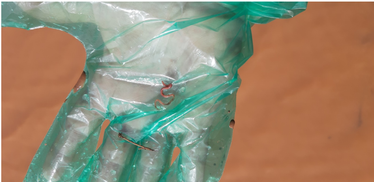
We searched the mud for forage items and found small thin earthworm type invertebrates in the mud.