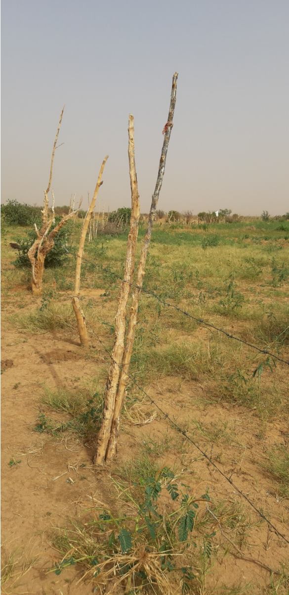
All of the water catchment areas we passed were surrounded by fences, some subsidised through Europe, to help protect the cultivated crops from wandering grazing herds.