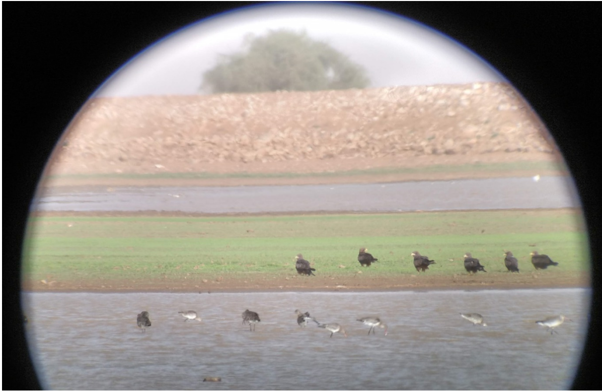
850 Godwits at the barrier lake of Lehneikatt (M38). A herd of cattle and goats were grazing on the lake edges, which had been cultivated in previous years but were currently in a resting stage. Cultivation was taking place only on the north-western boundary. The Black Kites in the background are scavengers and hardly ever disturbed godwits.