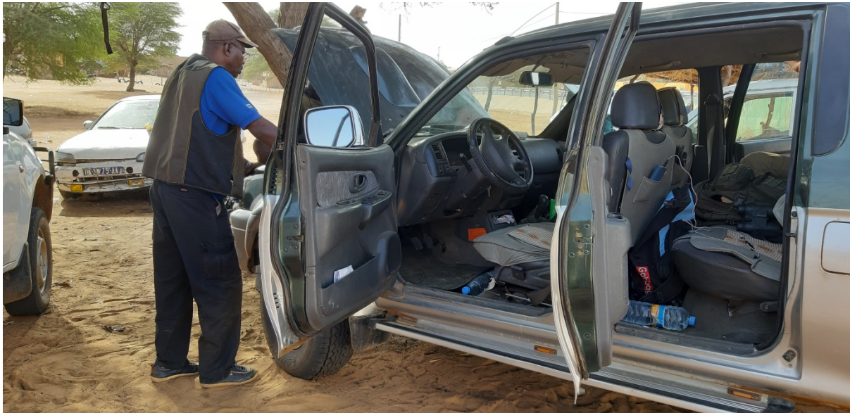
A necessary stop to fix leaking diesel fuel injectors.