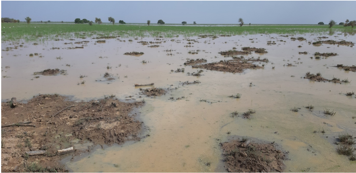
Lake Aleg, soils at the water edge were sandy clay and compacted from the large grazing herds visiting the lake to drink.