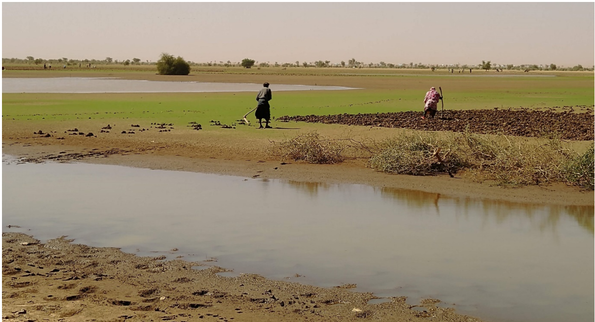
Near Bekel, a dike slows water loss in the temporary lake, at least 50 people were cultivating the receding flood line.