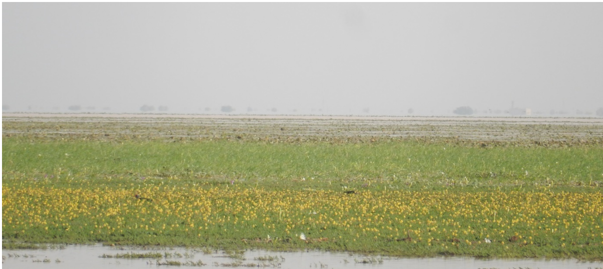
Lake Aleg, large areas of the lake were covered by bourgou (floating grasslands)