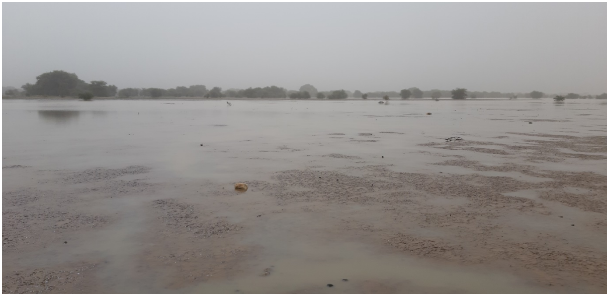
Just outside the village of Maghtalihjar (M34), behind the cemetery was a nice wetland with at least 290 godwits.

Twelve hours after we left we were back in Aleg where we spent the night.