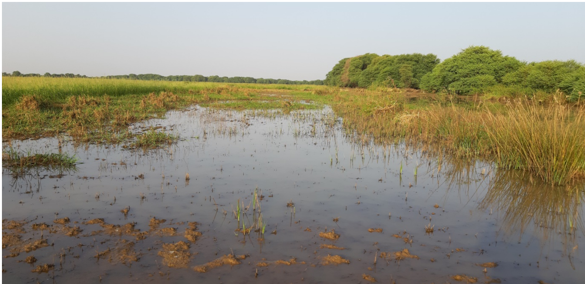
Site S3 NW of Podor. Most satellite locations came from the mudflat but we did not manage to get behind the impenetrable zone of trees and soft mud. Nevertheless, we did find 120 godwits , 900 Ruffs and at least 500 Garganeys in the set aside rice fields. The rice complex was not cultivated this year.