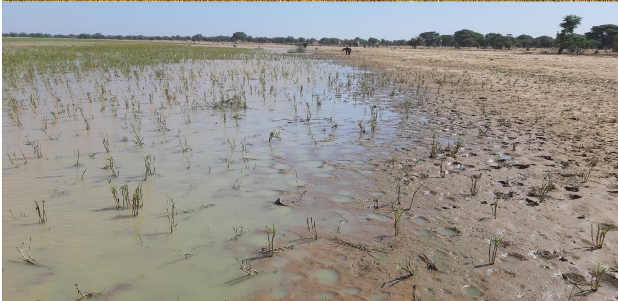
Around the 40x5 km big barrier lake east of Kaédi, we found the water was too deep on the western boundary and often large areas were covered in reeds and grasses. A few areas were shallow with herds of grazing animals nearby the water edge.