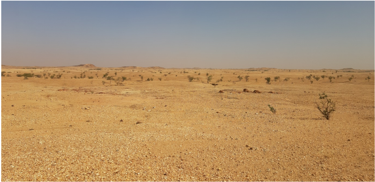
Bone dry pebble desert