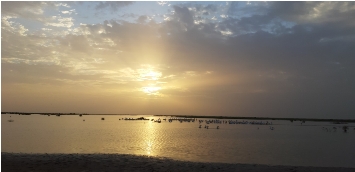
Sunset in the Diawling reserve with hundreds of pelicans, storks, cormorants, a few spoonbills and grebes.

The car of Zeine had a brake problem that needed to be fixed immediately. Therefore there was unfortunately no time for another field visit to find godwits. After breakfast we left Diawling and arrived in Nouakchott at Auberge Bienvenue in the afternoon. The German team had also arrived just before us. We had a lot to discuss about this memorable expedition! We slept in Nouakchott and in the next morning woke up early to catch our flight at 7:20 back to Amsterdam where we arrived in the late afternoon.