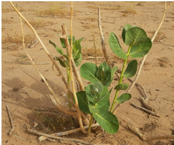
Along the inland road via El Mericha- Balaol- Bababé were several temporary wetlands that have been used by godwits in previous years. However, all of them (M19-M23) were completely dry. A signature plant species ( Calotropis procera ), indicating low lying water catchment areas.