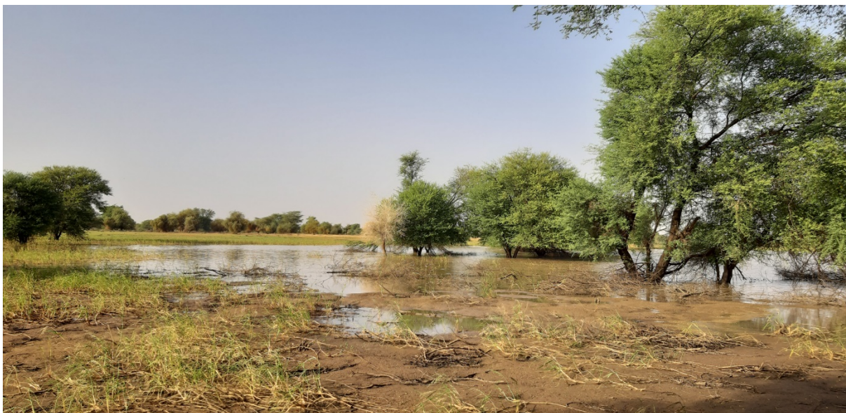
The wetland at S7, connected to the site at Halrar bridge. Access was difficult and many trees in the water obscured our view, but we saw 120 godwits arriving from the direction of the Halrar bridge which indicates that this area is a night time roost.