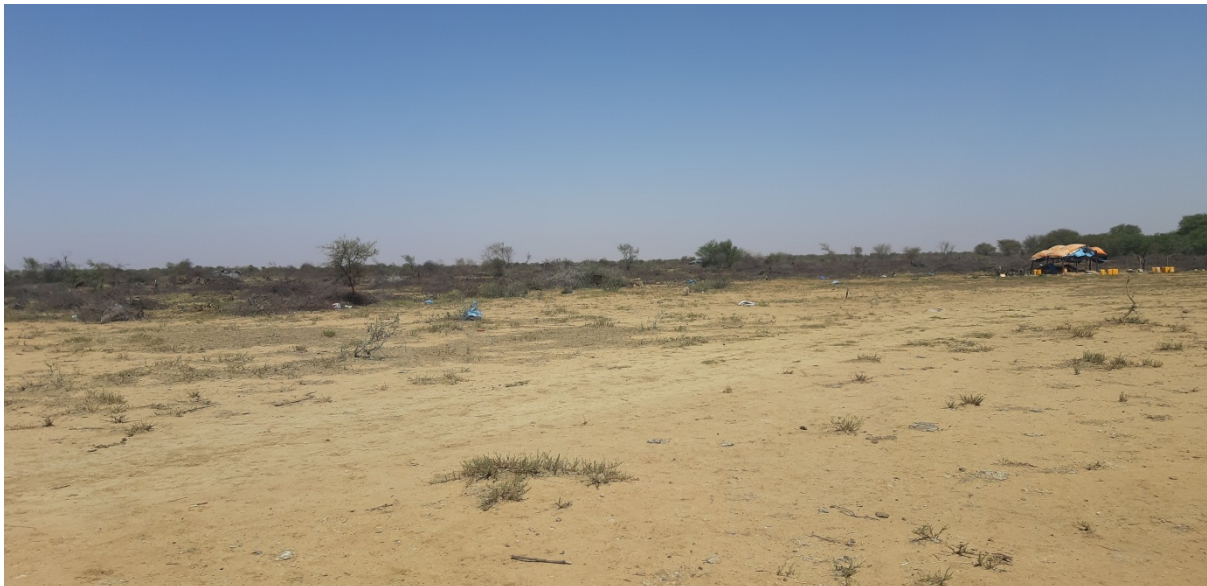
In the surrounding floodplains large areas of Acacia were being cleared and burned for charcoal. The area appears to be cleared for large scale cultivation. Similar areas in the neighbourhood had recently been fenced. The wetlands were replaced with intensive rice agriculture, in line with Senegal's commitment to strive for food security and independence in Senegal through rice agriculture.