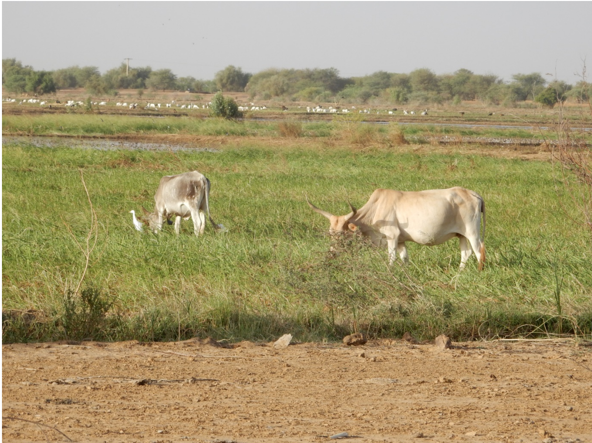
Cattle and goats permitted to freely graze within the rice complex since it was not cultivated this year.