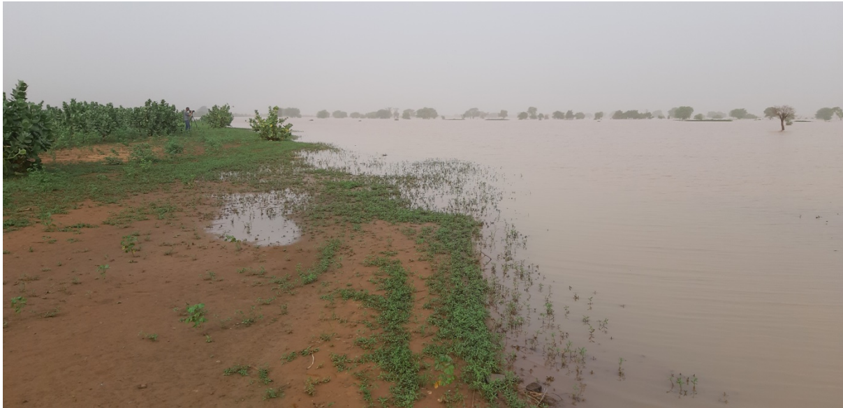
Shallow lake at Tertouguen where transmitter bird Tsjerkemar had been two days previous. We found 12 godwits, without rings.