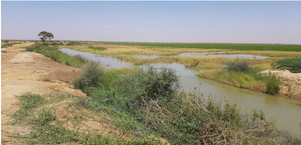
Near Lecceiba there is a huge intensive rice complex with canals channelling water to the rice fields from the Senegal river.