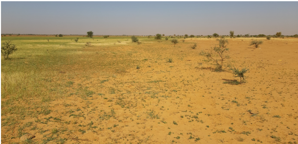
At M3 near Dar El Barka, and also on the west side of the village, we found out that the wetland had already dried up completely. Until 1 week previously a satellite tagged godwit had been using the area.