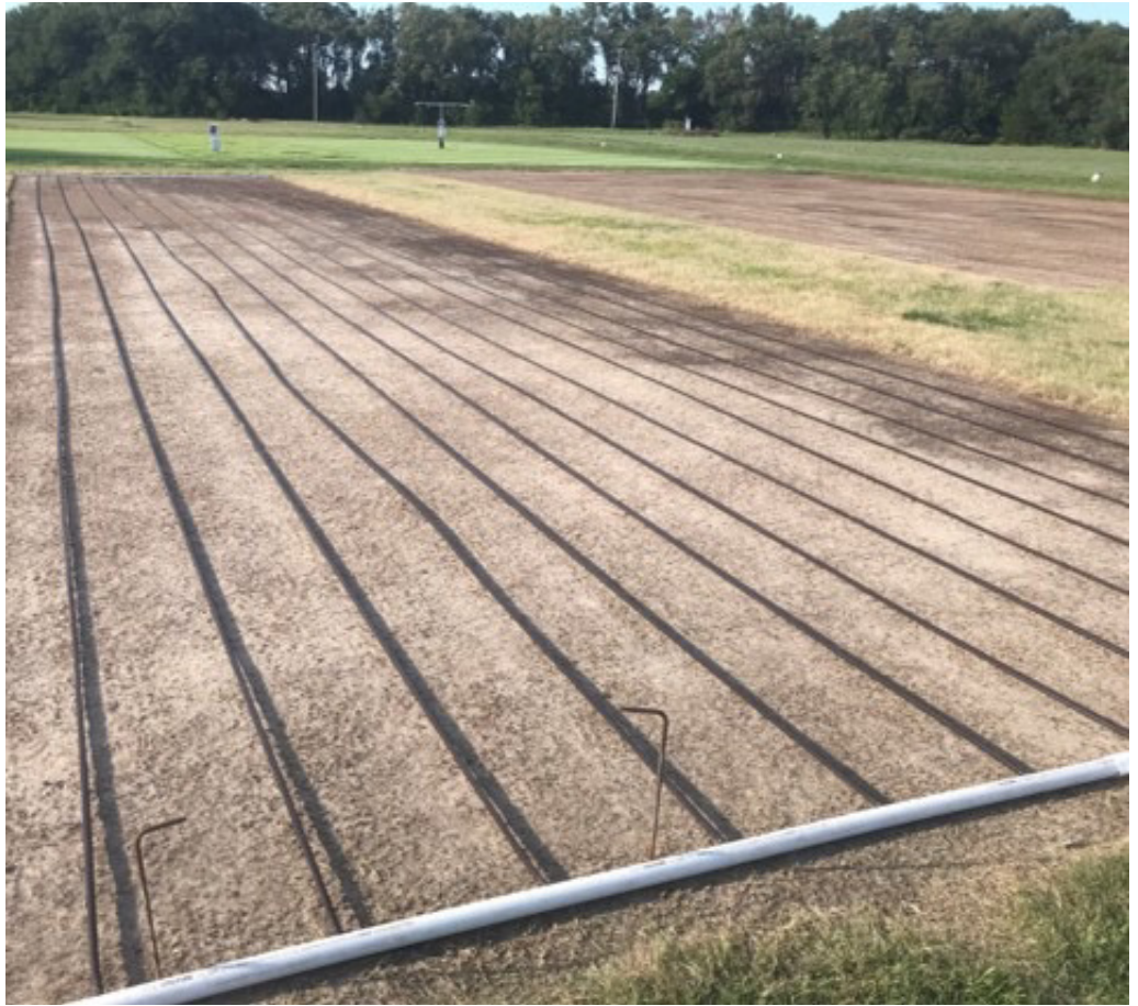
Figure 1. Aboveground drip irrigation system. In this study, driplines were spaced at 18 inches and rested on the soil surface. The subsurface drip irrigation driplines were nearly identical but were buried in the soil at 6 inches.