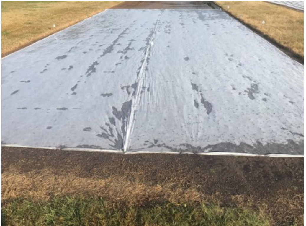
Figure 2. The entire plot area was covered with a polyester mesh cover immediately after seeding, primarily for erosion control. Covers were removed after emerging seedlings began to appear through cover, about one week after seeding.