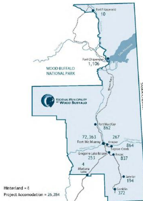
Figure 1 - Municipality of Wood Buffalo