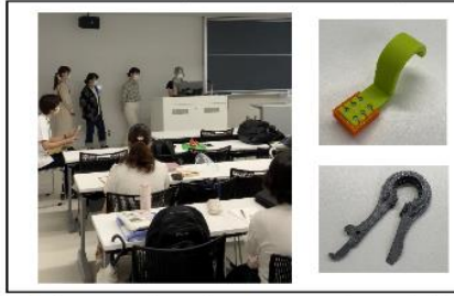
• The students' presentation of the selected self-help devices for the assignment