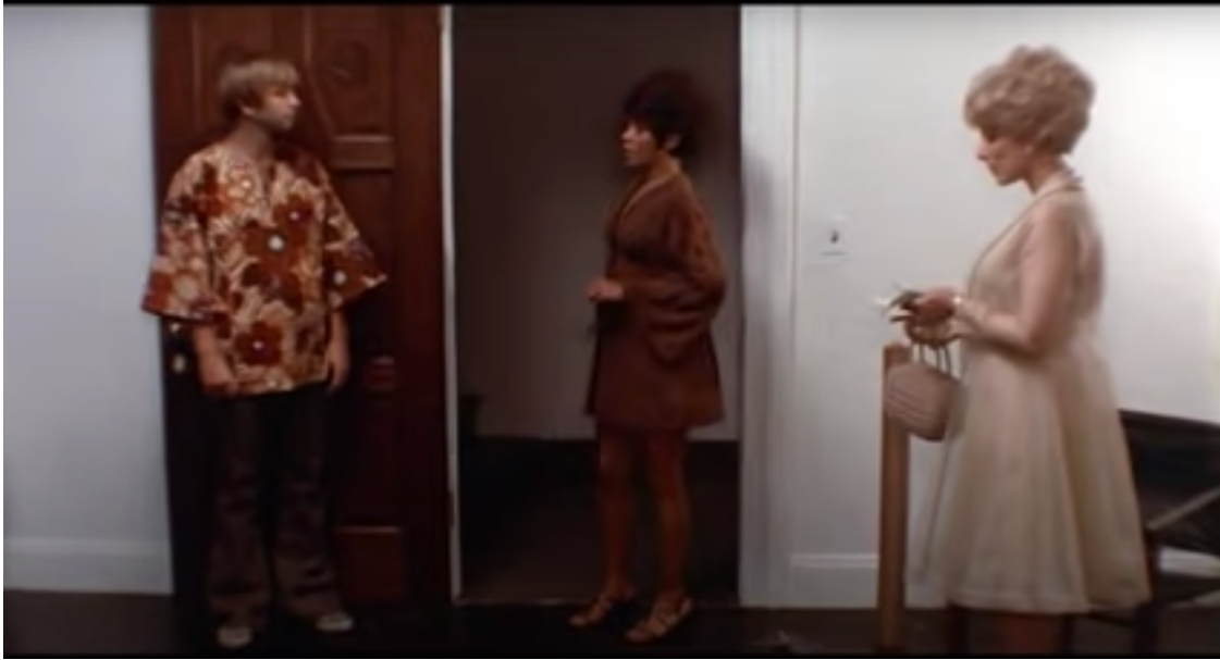
The Landlord (01:22:50)

A close examination of Gould’s anti-regulation argument alongside Ashby’s depiction of Elgar’s character reveals the ways in which attempts by landlords to appear vulnerable within the public eye often face the problem of self contradiction. It is difficult to claim economic precarity when you have already reaped many benefits of economic success. Why then, did these arguments prove so successful that they continued to permeate housing discourse for years to come? A possible answer is that the landlord occupies a unique position that commodifies the basic human need of housing into an intimate, two-person business transaction. The intimate relationship and mutual reliance between parties complicates the nature of ownership and vulnerability, making the landlord appear as a singular force struggling against masses of tenants and a multitude of shifting economic factors. Furthermore, the commodification of housing makes the role of the landlord lucrative, but also a social necessity. This tension between business and necessity is exemplified through the figure of the self-proclaimed “mom-and-pop landlord,” those who claim to be the polar opposite of “slumlords” and the antithesis of large,