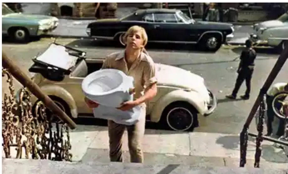
The Landlord (00:39:23)

building's residents, he decides to fix up the property, remain its landlord, and rebel against the wishes of his racist WASP parents. What follows is a narrative which many critics have claimed "provides a penetrating, wise and exact meditation on race relations at the end of the 1960s," 28 but ultimately epitomizes white saviorhood through the construction of the benevolent landlord figure. This depiction contributes to landlord identity building discourses of its time, highlighting the struggles Elgar must overcome mentally and physically as he manages tenant expectations alongside critique from his own family, who view his business venture as both revolting and shamefully charitable. In other words, Elgar feels constantly misunderstood, hated, judged, and does everything in his power to make up for it within his tenant relationships. Ultimately this desire to please forces him to eventually give up his role as landlord and pass the duties on to another family in the building.