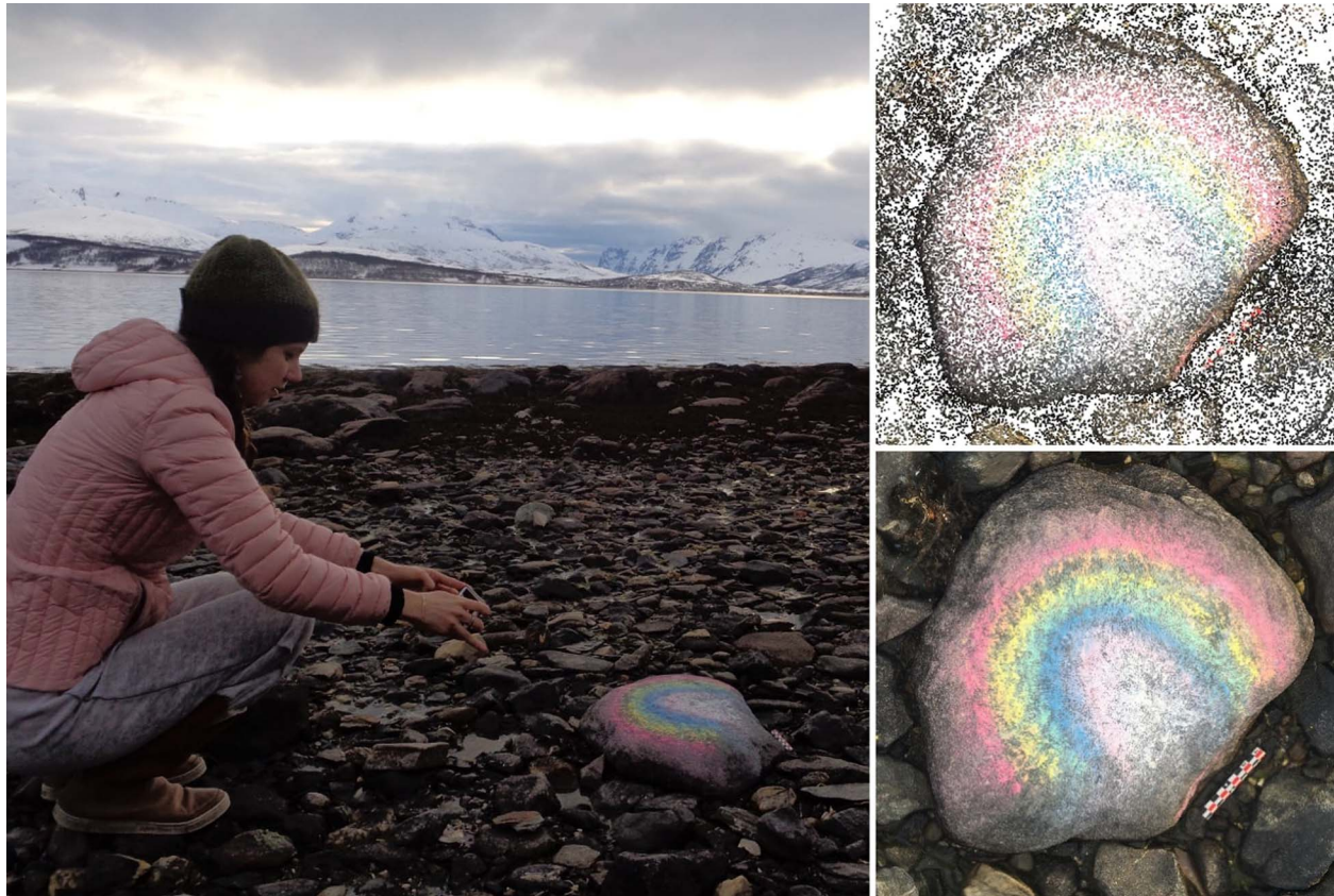
FIGURE 3. (left) Natalia Magnani collects data for a photogrammetric model of an ephemeral chalk representation on the southwest of the island; (right) images representing the workflow for photogrammetric modeling in Agisoft Metashape, from (top) sparse cloud generation to (bottom) generation of a textured model.