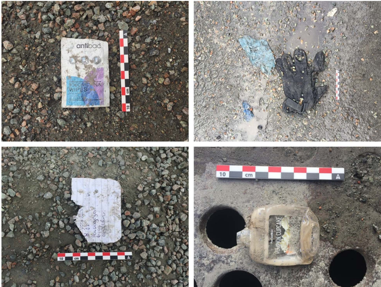
FIGURE 2. Sample of materials recorded during surveys of the downtown area photographed on April 20, 2020: (top left) antibacterial screen wipes; (top right) winter and protective gloves; (bottom left) shopping receipt; (bottom right) antibacterial hand sanitizer.

Using the camera phone on an iPhone 6, we moved around selected objects in a circle, varying camera height and angle. Between 27 and 47 photos were taken for each artifact (see Figure 3) and processed using Agisoft Metashape (for discussions on related expedient photogrammetric workflows, see Magnani et al. 2016, 2018). We acknowledge that Agisoft Metashape is not widely used by the broader public, although it has become standard in archaeological contexts. We point readers toward other open-source or low-cost alternatives available for devices from phones to computers on various operating systems (e.g., 3DF Zephyr Free, 3DS for Android OS, and Trnio for iOS).