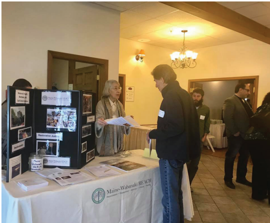
REACH tabling at the Bicentennial or Bust forum in Hermon, ME on March 15

We have always shared prayer and meditation in our circles since day one. Most recently we have been able to bring in CDs of traditional singing as well as beginning lessons of Wabanaki language, specifically Passamaquoddy.