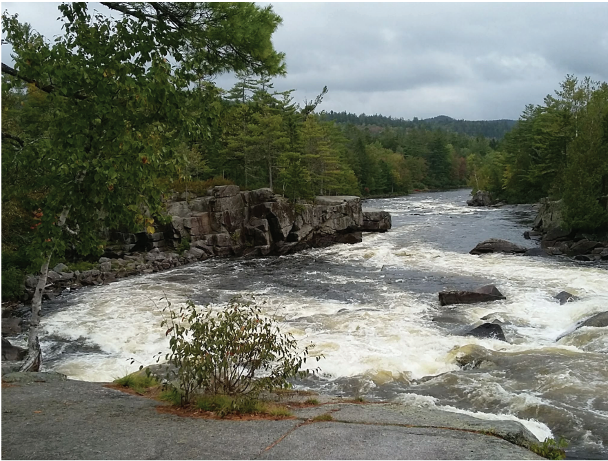
Upper West Branch of the Penobscot River