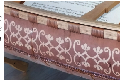
detail of Penobscot canoe on display at the Abbe Museum

This Spring at the University of Maine Statehood and Bicentennial Conference in Orono, we set up our art map and materials for Exploring Wabanaki Maine History. Participants entered slowly and shyly; many knew no one else in the room. Fifty historians, history teachers, museum staff and history buffs sat in circle. They seemed almost reluctant as I introduced the program, but as we continued, we shared our inherited and continuing history with some tears, some laughter, and many questions. In the circle following the scripted program, some told their own family story. We heard a woman whose ancestors were early European settlers in this territory. She said she imagines conversations with them as she envisions their world. We heard an Indigenous person whose ancestors stayed in place as others fought over and with them to claim territory. We heard a man whose family was persecuted in Europe and fled to this place of genocide of Wabanaki people. One history teacher told me on leaving, "I am throwing out my lesson plans and creating new ones, and I can't wait to get started."