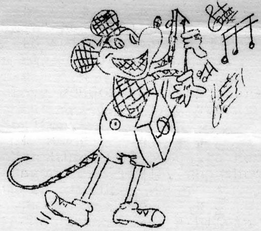
TOPOLOSKY (HIMSELF) SD.

Faithful Favor remains true to the girl back home.