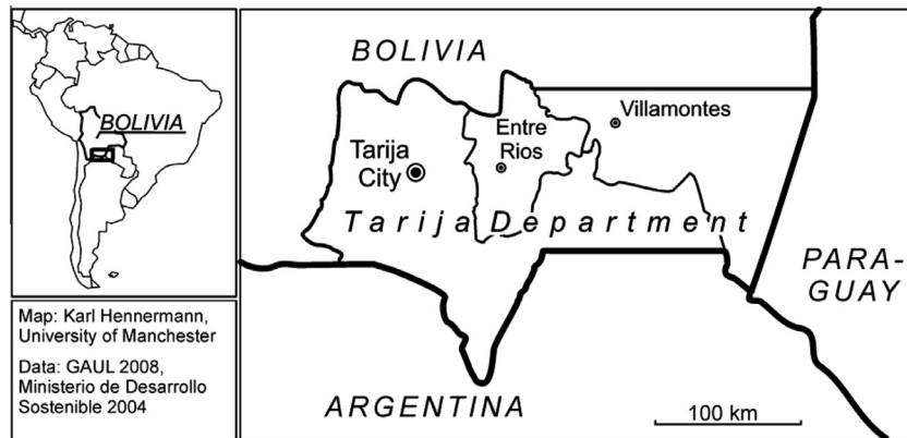
Fig. 1. Study area.

generates have been used in ways affected by pre-existing territorial projects in the region, and how the economy of gas and the central government's gas-related interests have frustrated the emergence of Tarija-wide coalitions and more coordinated territorial projects.