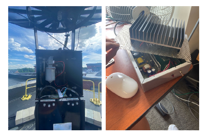
Fig 1: Images of the inside of the telescope (left) and controller (right).

The two main components of the SRT are the receiver and controller boxes. The receiver box sits at the focal point of the 3-meter parabolic mesh satellite dish. Here, a select frequency range (band) of radio signal is collected and transmitted to the controller box in the SRT office via coaxial cable and USBserial connection. From there, the computer software Java program written by the MIT Haystack team takes the radio frequency (RF) signal and develops a plot of the amplitude versus frequency, as shown in figure 2. The controller also directs two DC motors that aim the telescope in the azimuth (full 360 degrees) and elevation (90 degrees) directions.