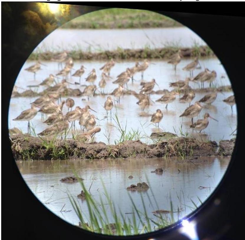
Godwits resting and preening in a ploughed rice paddy, in the rice fields of Agnack.