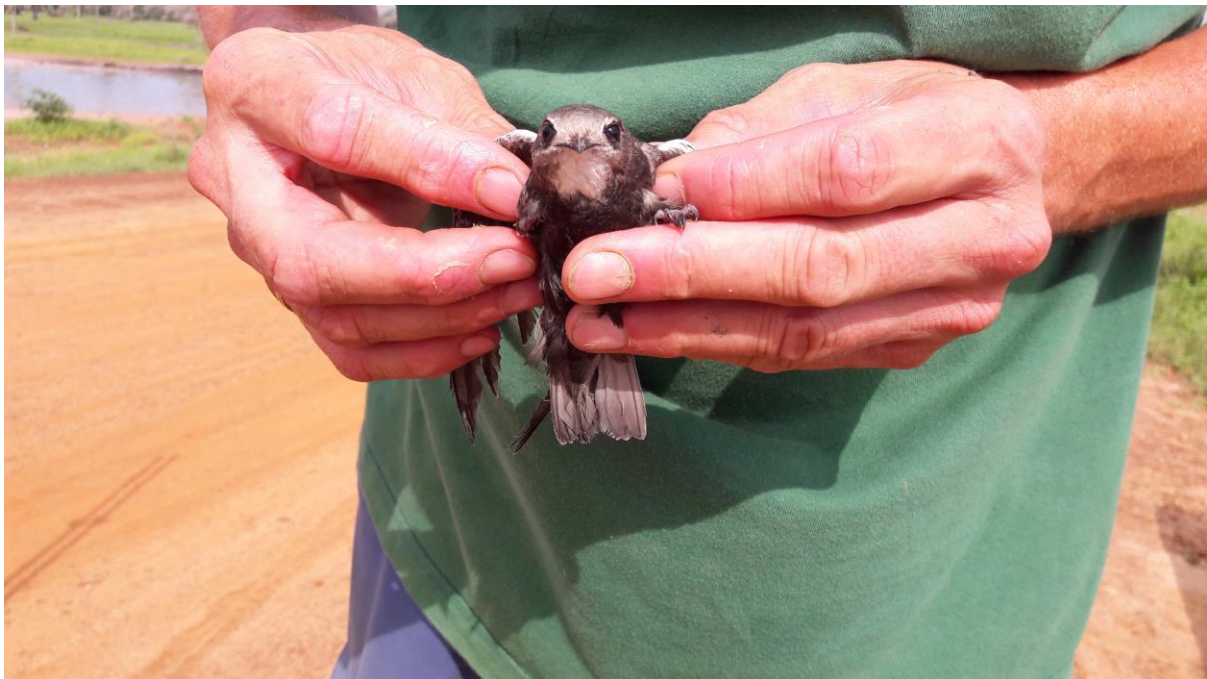
Project Little Swift rescue!