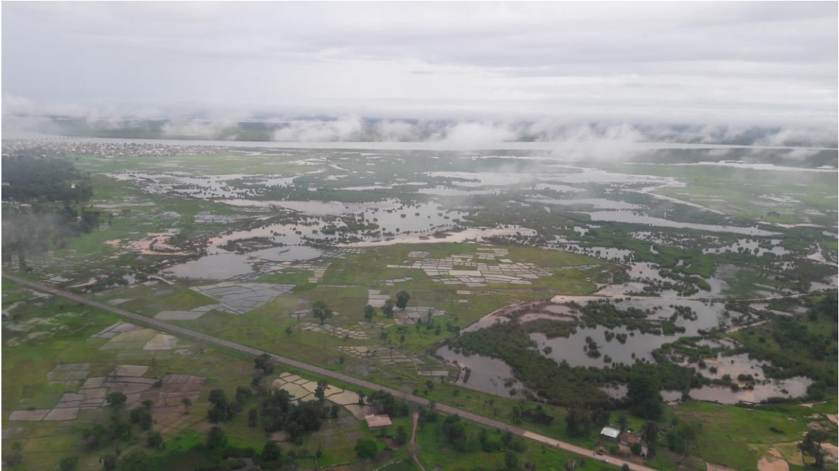
View from the plane of the rice fields adjacent to Ziguinchor, it's the rainy season! The soil is waterlogged and the rice paddies are filled with water.

It kept on raining (>70 mm today!) and on the way back to Bignona we stopped at the Colobane rice fields. But it was already getting too dark and most birds had probably already left to the roost. We only read 1 codeflag.