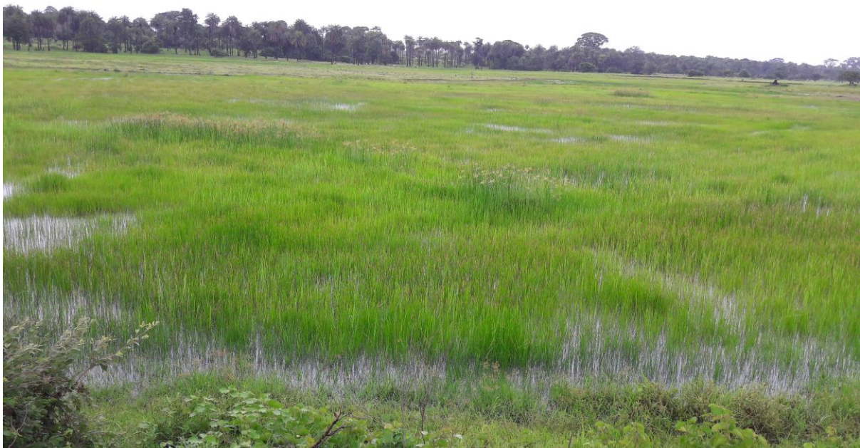
Dianki rice fields water buffer area, filled with water and reeds.

In the Dianki rice field complex there is a huge dike, installed by international funding. The dike separates the rice paddies from a mangrove wetland. The recent heavy rains have filled all the existing rice paddies and the large water buffer area. The sluice gate in the dike was open allowing the excess rainwater to flow from the water buffer area into the mangrove wetland. Salinity measured in the water buffer areas and rice paddies in preparation for planting was really low 20 – 200 \mu S, in the mangrove wetland it was higher around 3.4 mS. The highest salinity was encountered in the abandoned salinized rice on the outside of the big dike 6.9 mS. pH in the different habitats ranged from 9.5 to 6.0 and the heavily flooded soils were soft measuring between 0.1 to 8.2 on the lowest combination of spring and cone. We collected a further 16 habitat description points noting the current season differences from our previous visit in Nov/Dec 2016.