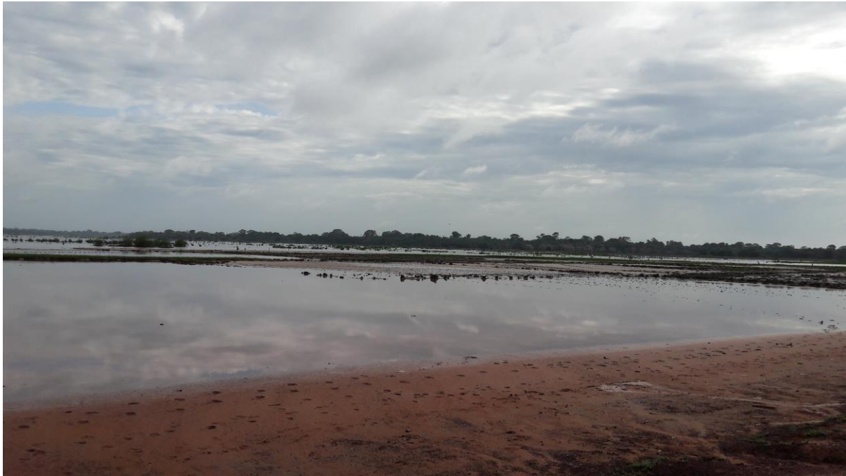
The shores of the mangrove wetland at Tobor.