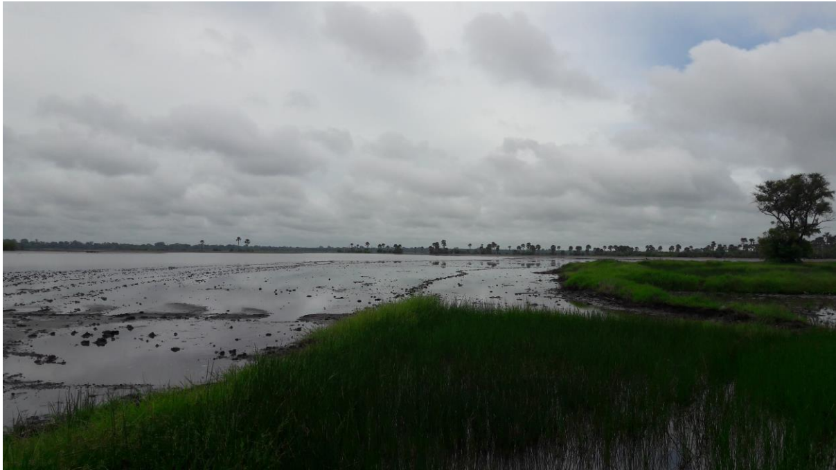
The saline shallow lake within the Roneraie de Diognere protected area.