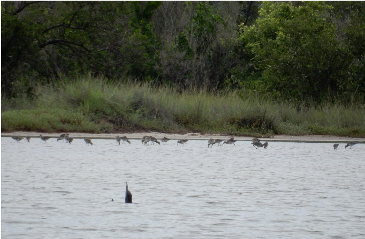
Godwits foraging in the saline shallow lake in the Djifangor mudflats.

fresh rains flooding the paddies create the perfect probing environment for godwits. It seemed today that the addition of the rice seedlings did not deter the godwits from returning to this rice paddy and any trampling of the seedlings may occur accidentally. We managed to get a few extra resightings in this group before we returned to Bignona.