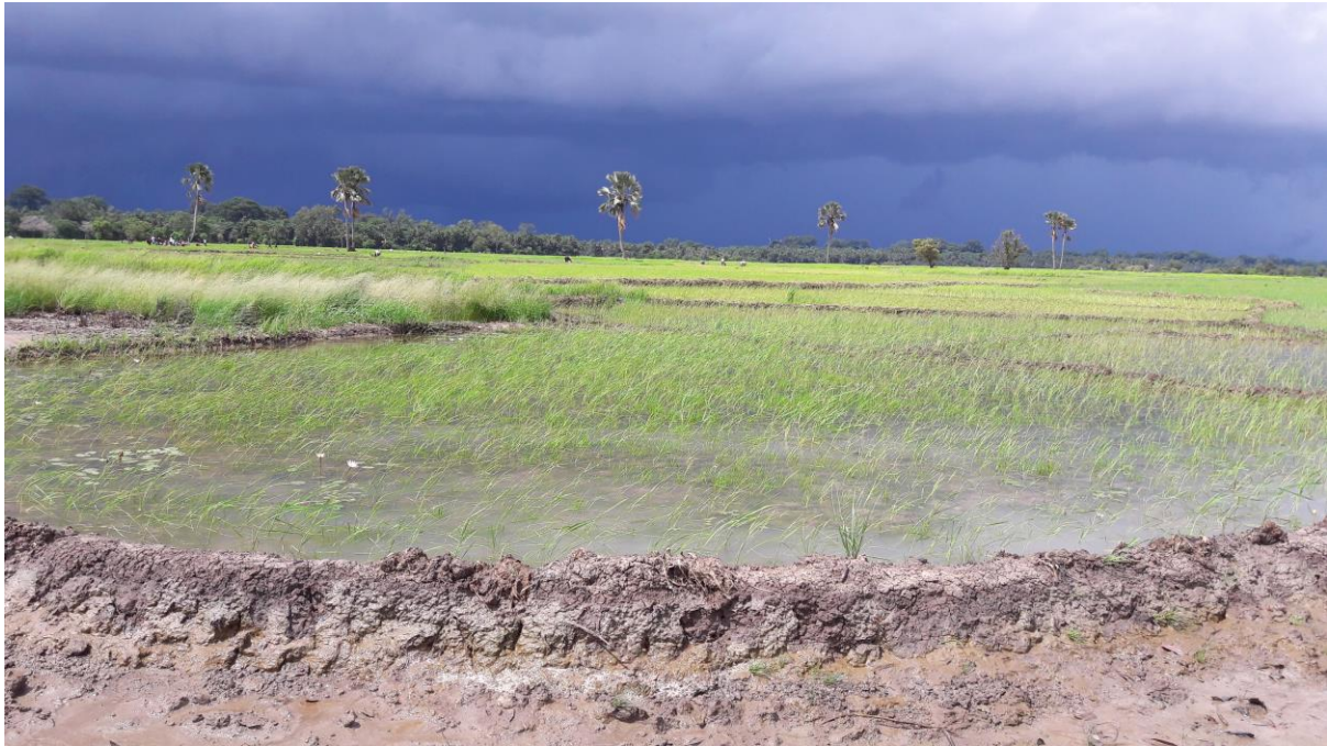
At the edge of the mangrove wetland and Fintiok rice paddies looking towards the approaching storm.