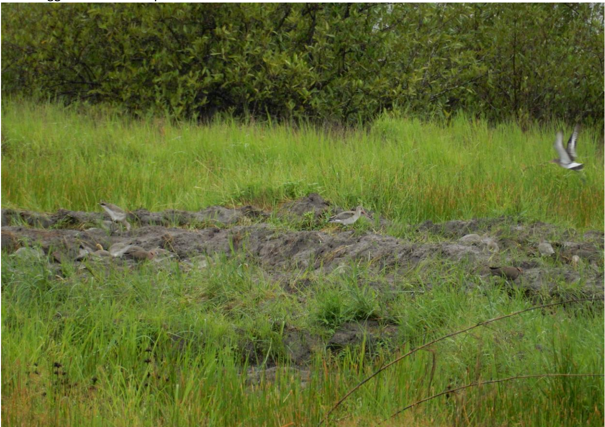
Godwits foraging on earthworms on the ploughed rice paddies.