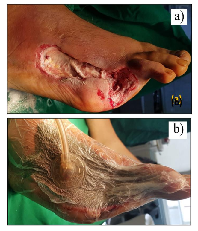
Figure 2. Use of vacuum therapy. a) Radial amputation with debridement and disinfection before applying vacuum therapy; b) Sponge application on diabetic foot (personal collection).

Another modern method used in our clinic for the treatment of diabetic foot is vacuum therapy (Figure 2, ab). Negative pressure therapy has dramatically changed the care of complex diabetic foot wounds.