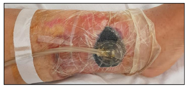
Figure 4 . Negative pressure therapy for ulceration in the lower-lateral third of the leg.

Although used in only 11 patients in the study group, negative pressure lesion therapy has a number of important benefits, such as reducing the size of the wound in the diabetic foot by increasing the mechanical traction exerted by the subatmospheric pressure on the edges of the wound, promoting healing in a much shorter time (Figure 4). In addition, it reduces the number of septic complications by healing chronic lesions, reduces the number of amputations and decreases the number of days of hospitalization and, therefore, the costs of hospitalization [23,24].