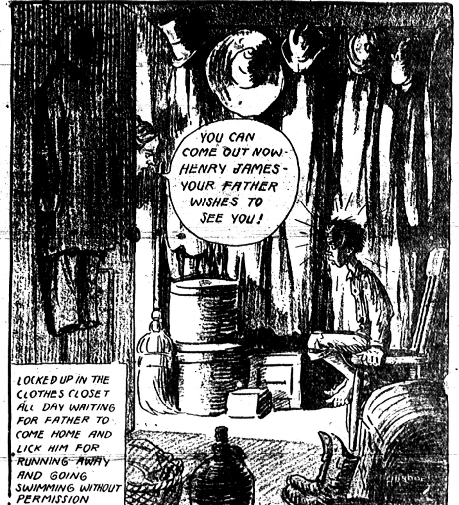
LOCKED UP IN THE CLOTHES CLOSET ALL DAY WAITING FOR FATHER TO COME HOME AND LICK HIM FOR RUNNING AWAY AND GOING SWIMMING WITHOUT PERMISSION