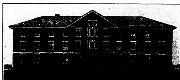
GIRLS' DORMITORY, ILLINOIS HOLINESS UNIVERSITY