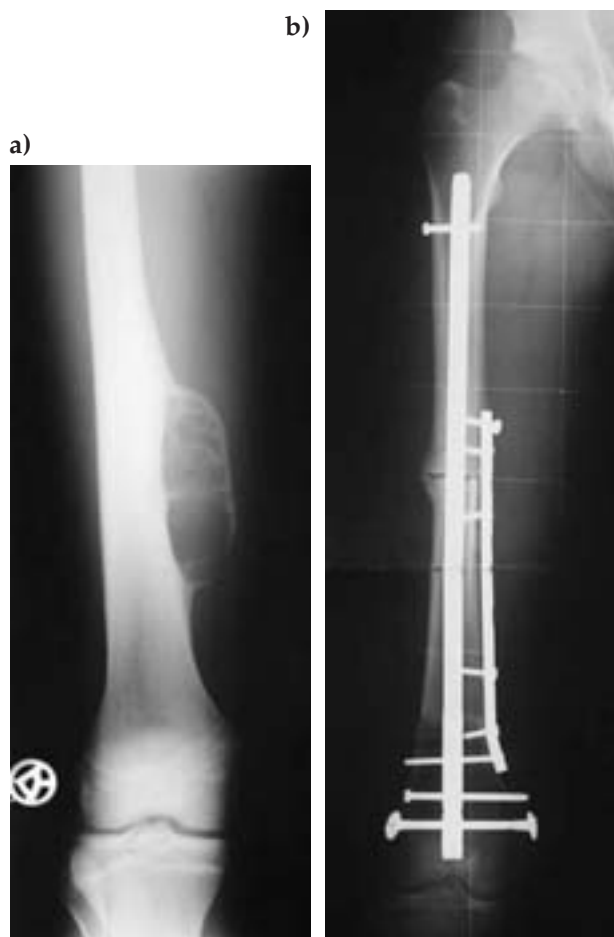
Figure 3. Radiographs of a 10-year-old boy with periosteal osteosarcoma localized in the femoral shaft (A). After "en bloc" resection reconstruction was performed with massive allograft, fixed with an unreamed femoral nail and plate and screws (B).

Historically, bone tumors were mostly treated by amputation, although this did not increase