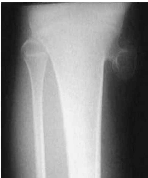
Figure 2. Osteochondroma localized in the proximal tibia. The treatment method is a simple tumor ablation.

during the subsequent operation. The principles of biopsy include complete radiologic staging before the biopsy, determining the most appropriate biopsy method (fine needle, core needle, open surgical biopsy), placing the biopsy tract appropriately. The possible complications of biopsy include hematoma, tumor-cell leakage, infection, and pathological fracture (1, 8, 9).