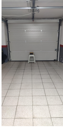
Figure 3. Experimental setting for indoor dim light

2) Scenarios : Four different scenarios have been applied for evaluation purposes. Considering light intensity, scenarios are the following: