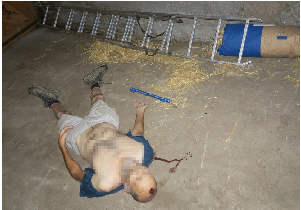
Fig. 1 A cliché scene of death for a Jefferson fracture: note the laceration and abrasion near the apex and the broken ladder in the background

near the lateral arches, an acute fracture of the odontoid process of the axis with posterior displacement of the dens, a posterior displacement of the foramen magnum and skull as compared with the cervical vertebrae, and acute fractures of the bodies of C5 and C6.