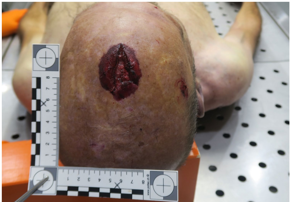
Fig. 2 Close up view of the laceration and abrasion of the scalp once cleaned. Note that they are located forward of the apex

The external examination and imaging results made it clear that the laceration on the man's skull were most likely due to a fall on the head. The impact point being located slightly forward of the apex, the forces transmitted down the cervical spine would not have been purely vertical, but would also have had a posterior component. This posterior component probably explains the fracture of