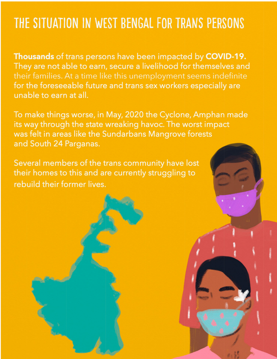
Figure 3. Fundraiser for trans sex workers in West Bengal.

Several members of the trans community have lost their homes to this and are currently struggling to rebuild their former lives.