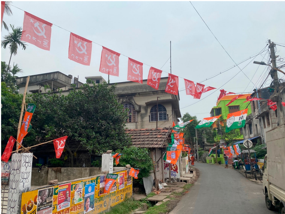
Figure 1. CPIM, BJP and TMC flags during the West Bengal Legislative Elections, 2021.

This has been a concern in the present political moment in India, where despite the decriminalisation of homosexuality since 2018, social anxieties and discrimination of LGBTQ people and the significance of this as transgressing an image of India as an otherwise modern and progressive state (Boyce and Dasgupta, 2017; Dasgupta 2017; Rao 2020).