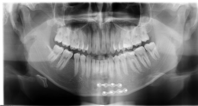
Figure 2. A healthy non-smoking 18-year-old male without history of alcohol and/or substance abuse sustained a mandibular parasymphysis fracture in a traffic accident. The fracture was operated on two days after injury. Postoperative dental panoramic tomography image shows optimal fixation with two miniplates and screws. A postoperative antibiotic regimen (Penicillin V) of four days was prescribed. Despite adequate fracture treatment, the patient had a surgical site infection nine days postoperatively without any clinically significant cause.