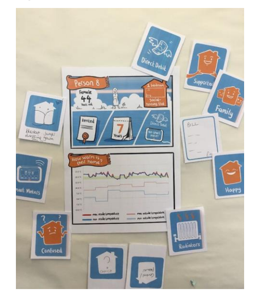
Figure 1: The use of visual methods to support data analysis

p. 8. Being Warm Being Happy: Understanding factors influencing adults with learning disabilities being warm and well at home: an inclusive research study