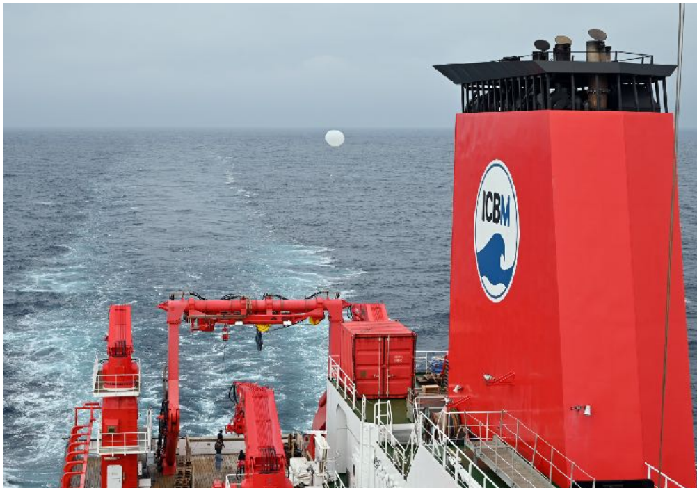
Successful first radiosonde launch from the working deck of RV Sonne.

We are using the time until then to prepare ourselves and our instruments on board. While the working deck and the laboratories seemed empty and deserted at the beginning of our cruise, this has changed significantly in the last few days. By now, all instruments are installed and we could already collect a first profile of the atmosphere - with the help of a radiosonde - and a first profile of the ocean - with the help of a CTD. Both went well, which is an important first step for us for the measurements in the coming weeks.