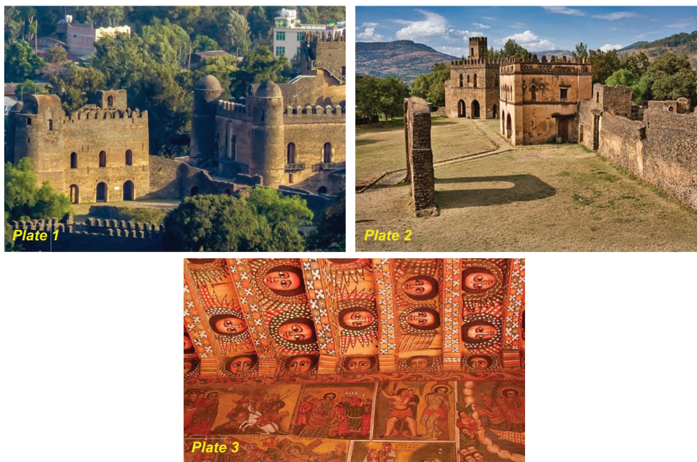
Figure 2: Some Views of the Royal Enclosure and Inner Murals of Debre Berhan Selassie Church