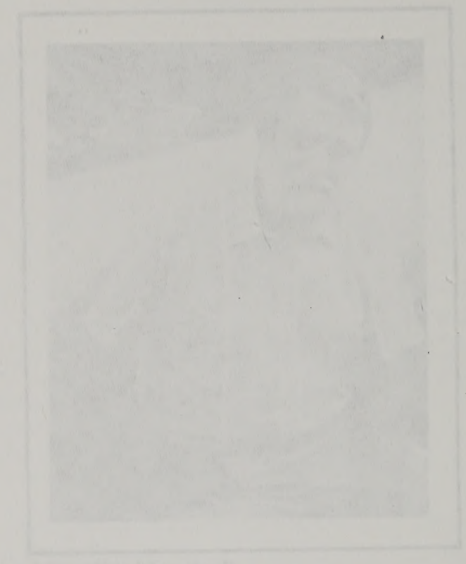
march a profitch of the profession?