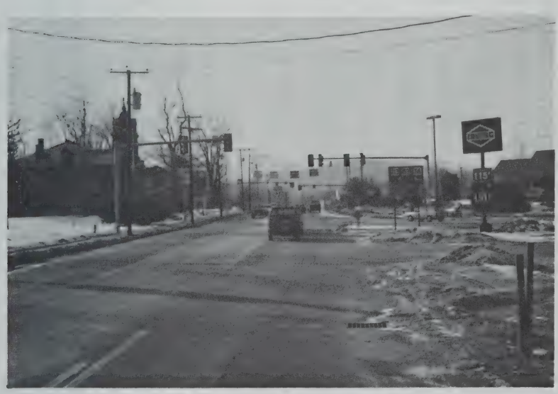
New traffic lights in Conway at Library and Rte. 16 & 113 looking west.