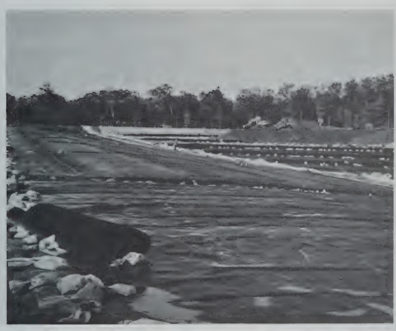
New Conway Landfill under construction - East Conway Road