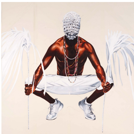
FAHAMU PECOU, THE RETURN, 2016, ACRYLIC ON CANVAS, 96' X 96''

Through performance, painting, drawing, music, and video, Pecou reframes our view,