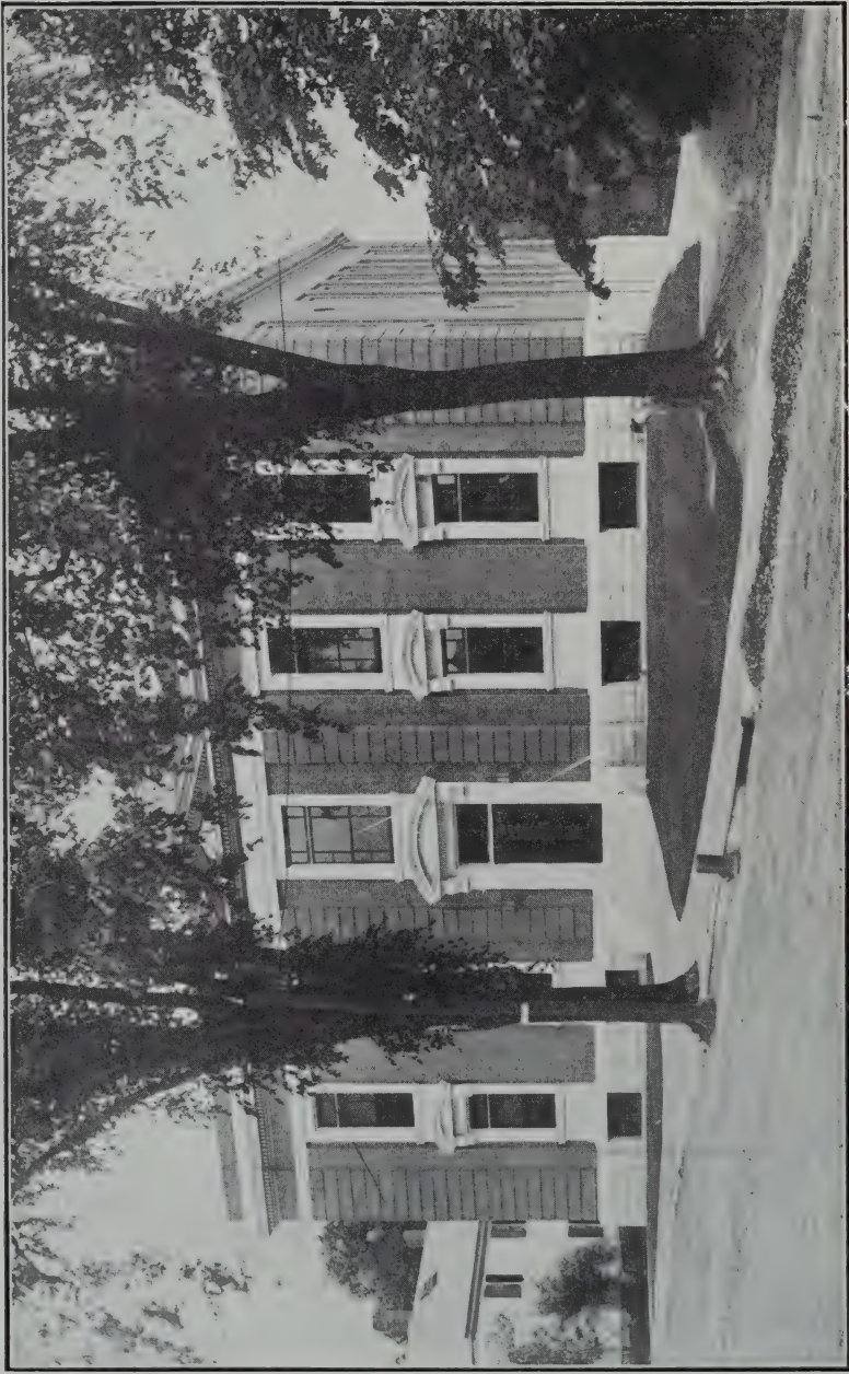
NASHUA COURT HOUSE