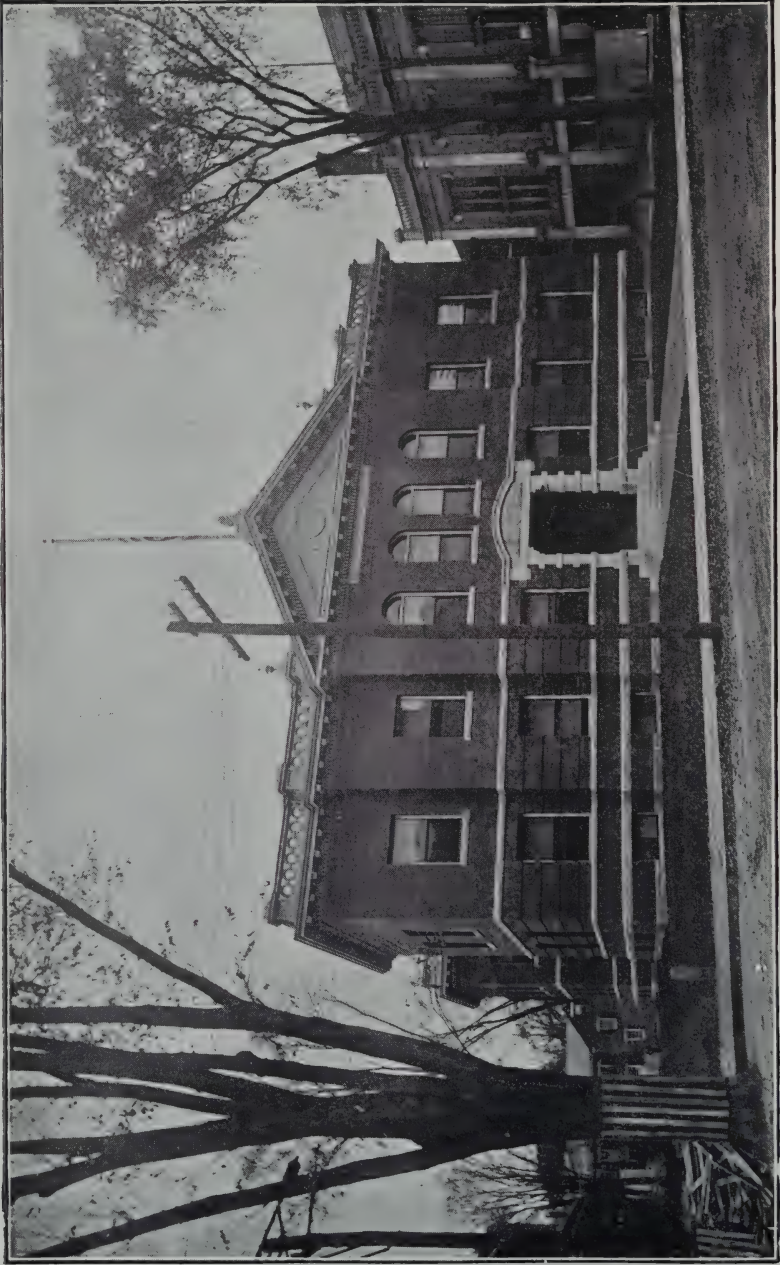
MANCHESTER COURT HOUSE