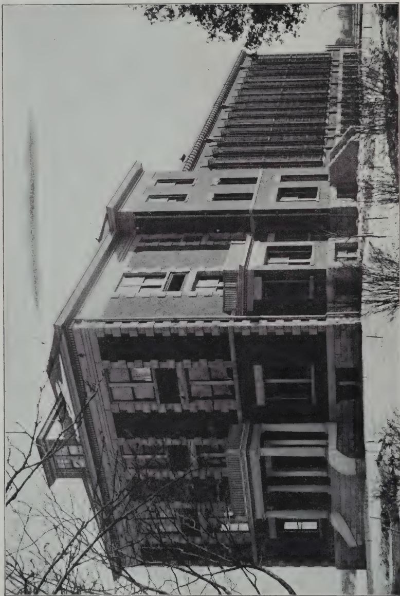
HILLSBOROUGH COUNTY JAIL