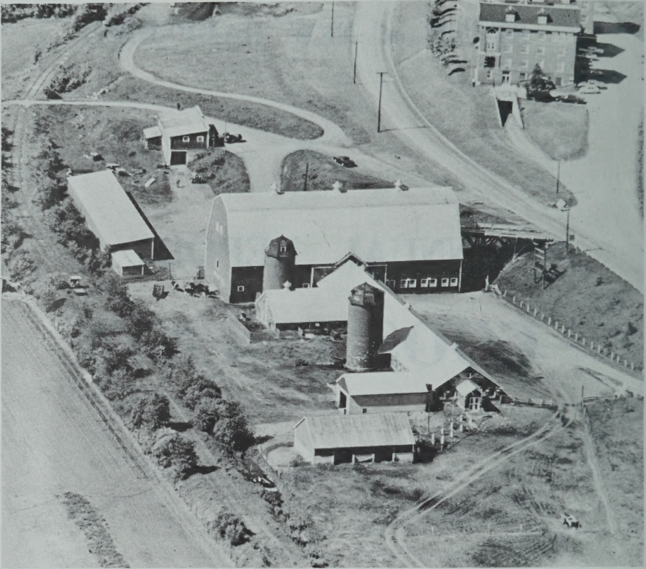
THE COOS COUNTY FARM....West Stewartstown, N. H.

(Front Cover) THE COOS COUNTY NURSING HOME AND HOUSE OF CORRECTION....West Stewartstown, N. H.